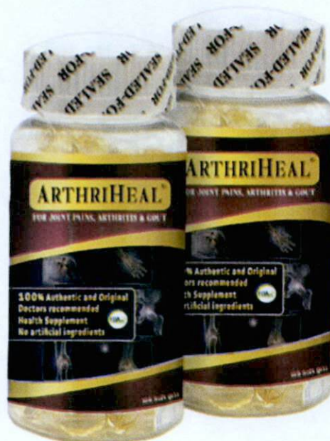
Figure 3. Unregistered ARTHRIHEAL Health Supplement