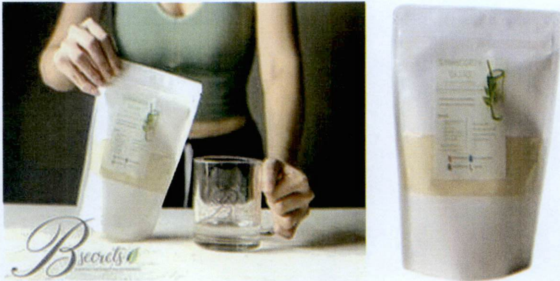
Figure 4. Unregistered B SECRETS Slimming Green Tea Juice

The FDA verified through online monitoring or post-marketing surveillance that the abovementioned food supplements and food product are not registered and no corresponding Certificates of Product Registration (CPR) have been issued. Pursuant to the Republic Act No. 9711, otherwise known as the “Food and Drug Administration Act of 2009”, the manufacture, importation, exportation, sale, offering for sale, distribution, transfer, non-consumer use, promotion, advertising or sponsorship of health products without the proper authorization is prohibited.