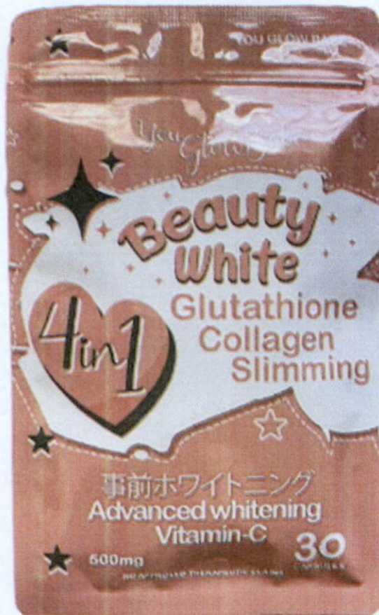
Figure 1. Unregistered YOU GLOW BABE BEAUTY WHITE 4in1 Glutathione, Collagen, Slimming, Advanced Whitening Vitamin-C Capsules

The Food and Drug Administration (FDA) warns all healthcare professionals and the general public NOT TO PURCHASE AND CONSUME the following unregistered food supplements and food product: