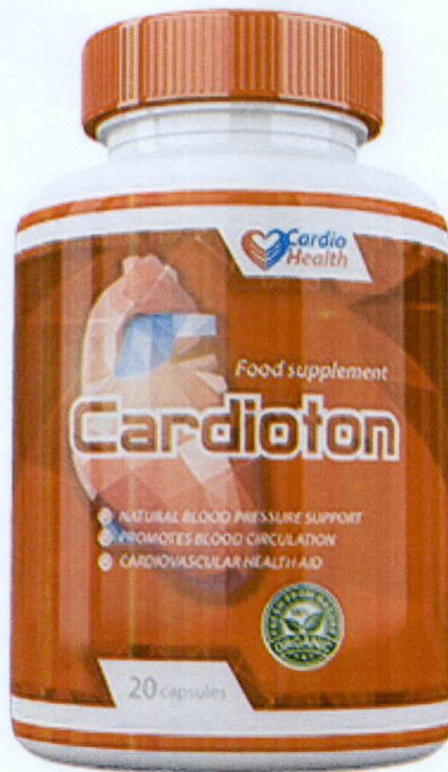
Figure 2. Unregistered CARDIO HEALTH Cardioton Food Supplement