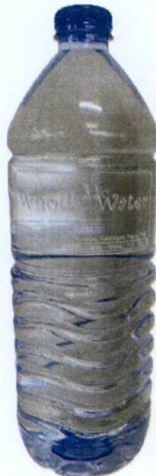
Figure 1. Unregistered Wholly Water

The Food and Drug Administration (FDA) warns all healthcare professionals and the general public NOT TO PURCHASE AND CONSUME the unregistered food product: