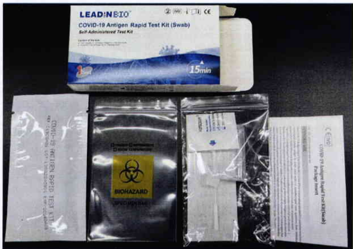
Figure 1. Uncertified Self-Administered COVID-19 Test Kit "LEADINBIO Covid-19 Antigen Rapid Test Kit (Swab)"

The Food and Drug Administration (FDA) warns all healthcare professionals and the general public NOT TO PURCHASE AND USE the uncertified self-administered COVID-19 test kit: