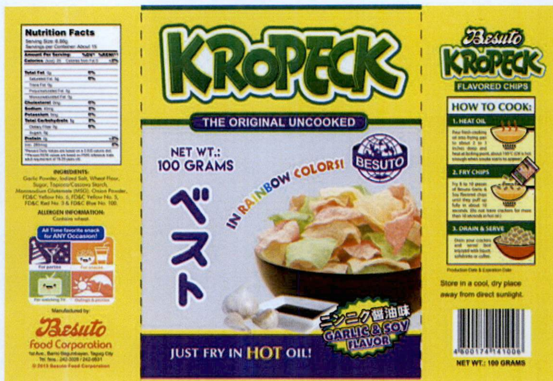
Figure 1. The Approved label of BESUTO Kropeck Garlic Flavor – Raibow Colors with registration number FR-400009503443 issued on 07 June 2022 valid until 07 June 2024 .

The Food and Drug Administration (FDA) informs the public that the food product BESUTO Kropeck Garlic Flavor – Raibow Colors is now registered by the Market Authorization Holder (MAH) BESUTO FOOD CORPORATION in accordance to existing FDA rules and regulations.