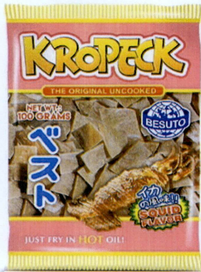
Figure 1. The Approved label of BESUTO Kropeck Squid Flavor, Net Wt. 100 Grams with registration number FR- 4000009503313 valid until 15 June 2024 .

The Food and Drug Administration (FDA) informs the public that the food product BESUTO Kropeck Squid Flavor, Net Wt. 100 Grams has been registered by the Market Authorization Holder (MAH) BESUTO FOOD CORPORATION in accordance to existing FDA rules and regulations.