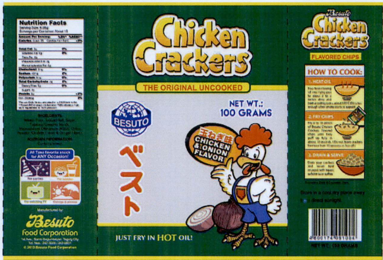
Figure 1. The Approved label of BESUTO Chicken Crackers - The Original Uncooked - Chicken and Onion Flavored Chips with registration number FR-400009501463 issued on 02 June 2022 valid until 02 June 2024 .

The Food and Drug Administration (FDA) informs the public that the food product BESUTO Chicken Crackers - The Original Uncooked - Chicken and Onion Flavored Chips is now registered by the Market Authorization Holder (MAH) BESUTO FOOD CORPORATION in accordance to existing FDA rules and regulations.