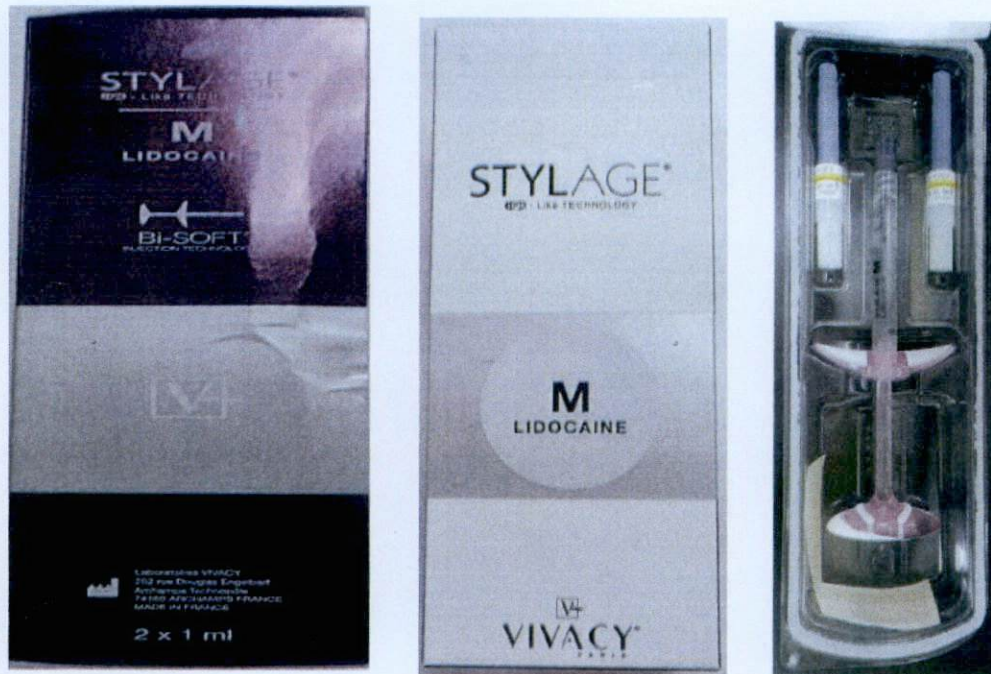
Figure 1. STYLAGE IPN – LIKE TECHNOLOGY M LIDOCAINE

The Food and Drug Administration (FDA) informs all healthcare professionals and the general public that the medical device product, STYLAGE IPN – LIKE TECHNOLOGY M LIDOCAINE, has been issued an FDA Certificate of Medical Device Registration to the Market Authorization Holder (MAH), AJ Research & Pharma Inc., in accordance to existing FDA rules and regulations.