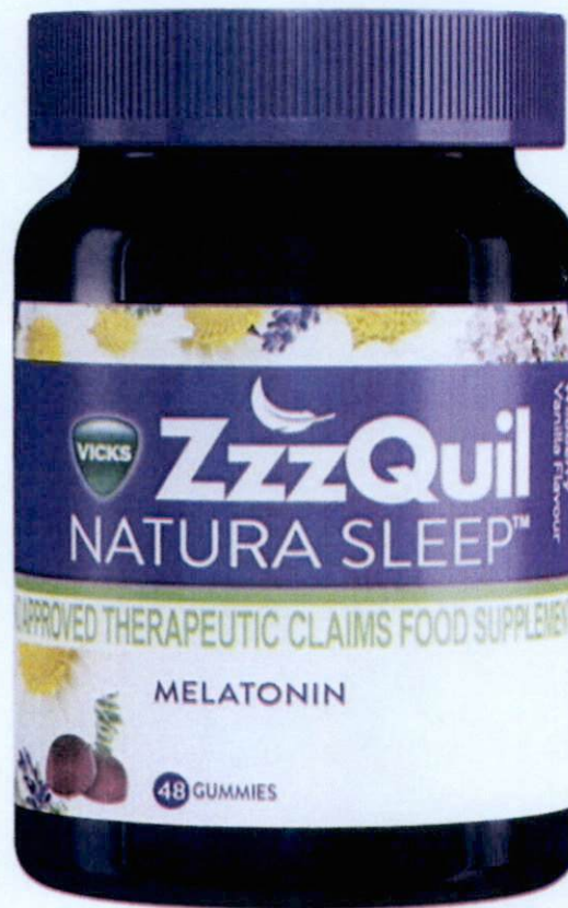
Figure 1. The Approved label of PROCTER & GAMBLE PHILIPPINES, INC. with registration number FR- 4000008086499 valid until 02 February 2023 .

The Food and Drug Administration (FDA) informs the public that the food product VICKS ZZZQUIL NATURA SLEEP Melatonin Food Supplement Gummies Wildberry Vanilla Flavor has been registered by the Market Authorization Holder (MAH) PROCTER & GAMBLE PHILIPPINES, INC. in accordance to existing FDA rules and regulations.