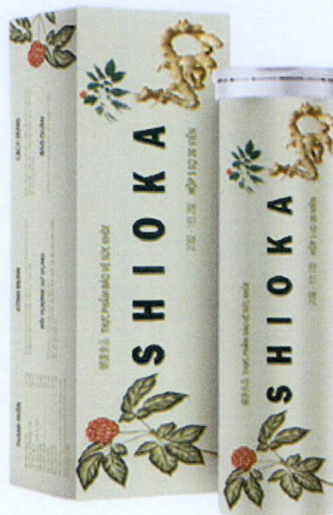
Figure 2. Unregistered Shioka Herbal Help Support Uterine Fibroids and Ovarian Cyst 20 Effervescent Tablets

The Food and Drug Administration (FDA) warns all healthcare professionals and the general public NOT TO PURCHASE AND CONSUME the following unregistered food supplements: