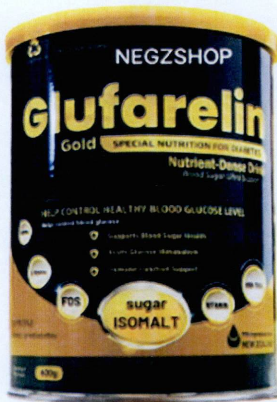
Figure 2. Unregistered NEGZSAHOP Glufarelin Gold Milk Special Nutrition for Diabetes