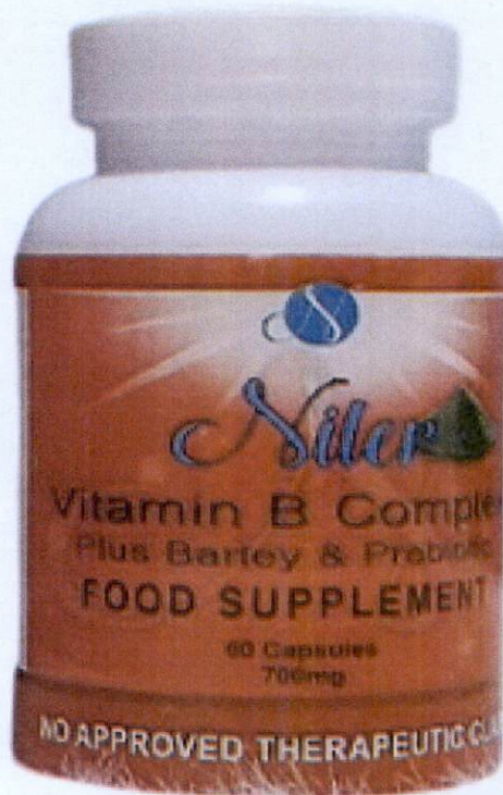
Figure 3. Unregistered NILER Vitamin B Complex Plus Barley & Prebiotic Food Supplement