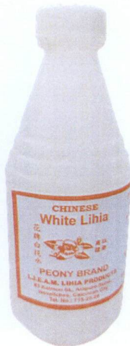
Figure 1. Unregistered PEONY BRAND Chinese White Lihia

The Food and Drug Administration (FDA) warns all healthcare professionals and the general public NOT TO PURCHASE AND CONSUME the unregistered food product: