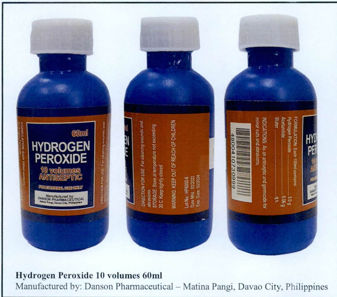
Figure 1: Unregistered drug product

The Food and Drug Administration (FDA) advises the public against the purchase and use of the unregistered drug product: