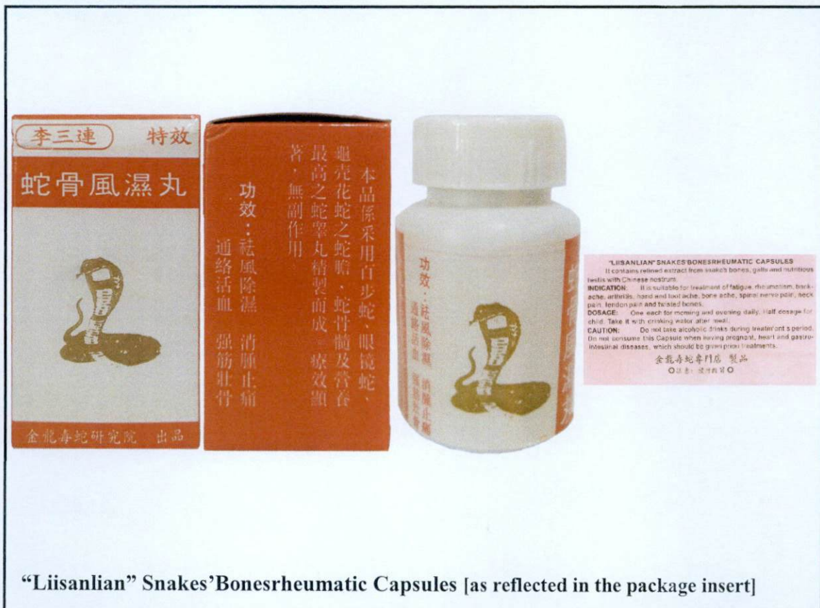
Figure 3. Unregistered drug product