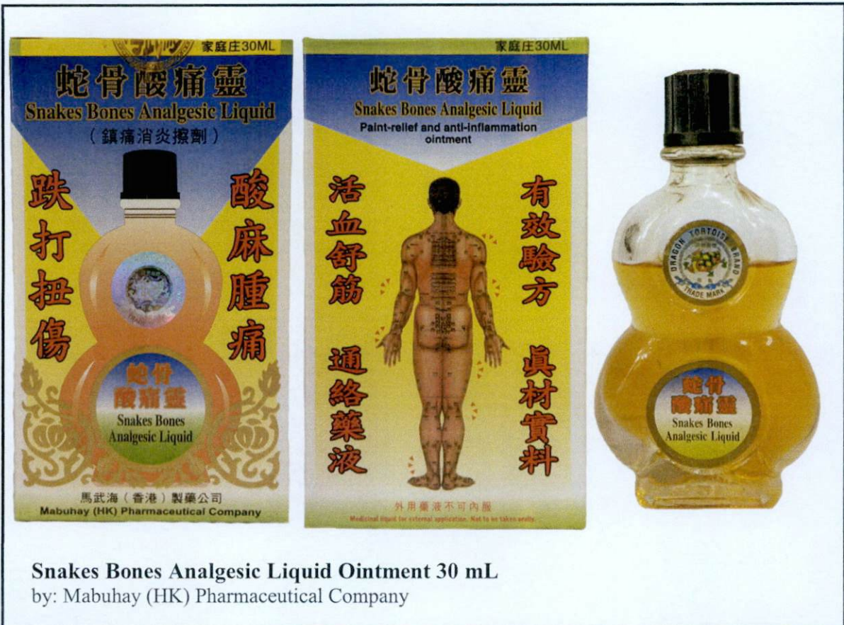
Figure 2. Unregistered drug product