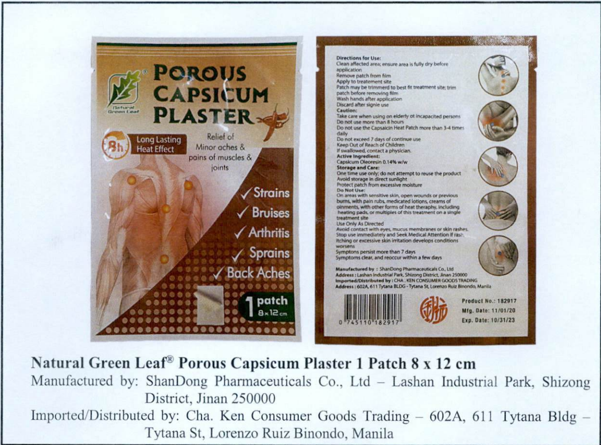
Natural Green Leaf® Porous Capsicum Plaster 1 Patch 8 x 12 cm Manufactured by: ShanDong Pharmaceuticals Co., Ltd – Lashan Industrial Park, Shizong District, Jinan 250000 Imported/Distributed by: Cha. Ken Consumer Goods Trading – 602A, 611 Tytana Bldg – Tytana St, Lorenzo Ruiz Binondo, Manila