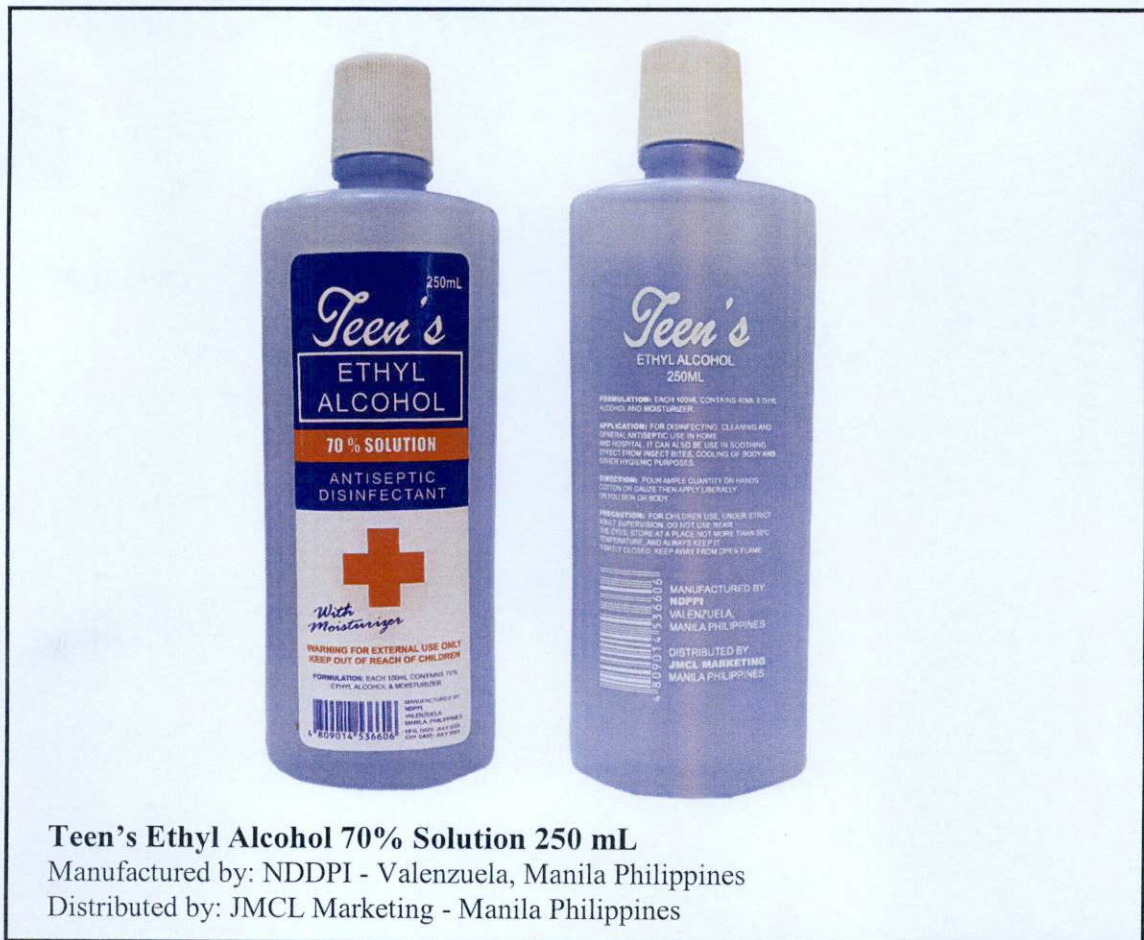
Figure 1. Unregistered drug product

The Food and Drug Administration (FDA) advises the public against the purchase and use of the following unregistered drug products: