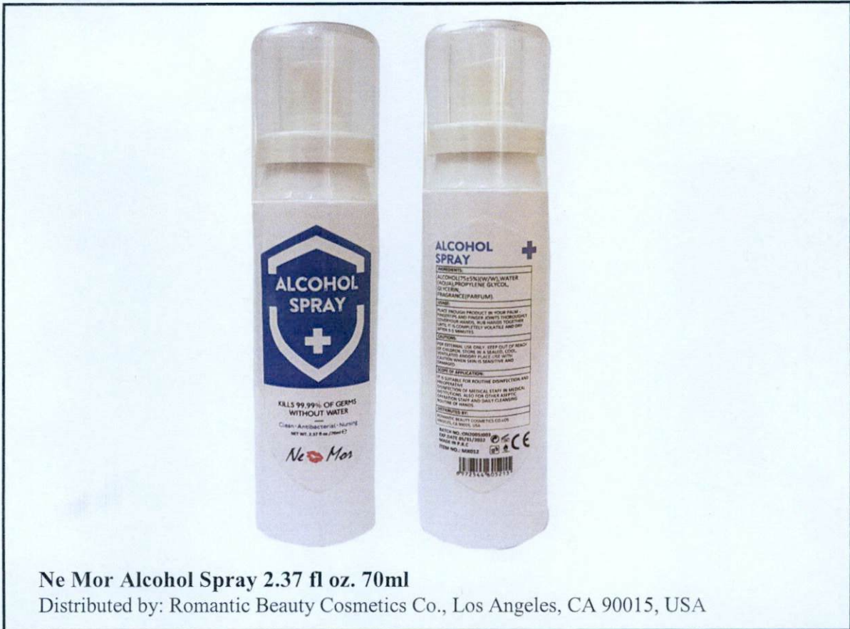
Ne Mor Alcohol Spray 2.37 fl oz. 70ml Distributed by: Romantic Beauty Cosmetics Co., Los Angeles, CA 90015, USA