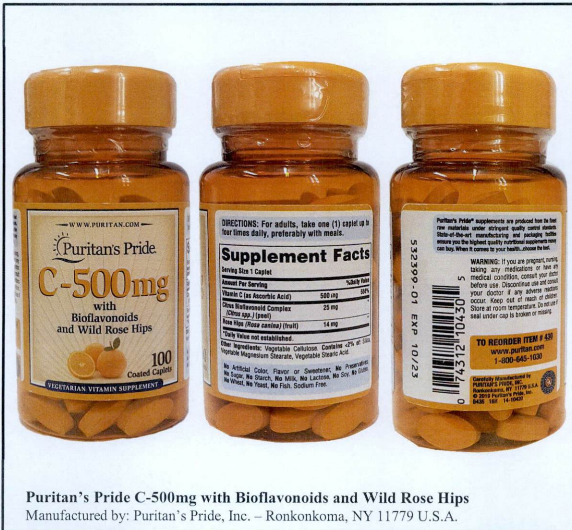
Puritan’s Pride C-500mg with Bioflavonoids and Wild Rose Hips Manufactured by: Puritan’s Pride, Inc. – Ronkonkoma, NY 11779 U.S.A.

The Food and Drug Administration (FDA) advises the public against the purchase and use of the unregistered drug product: