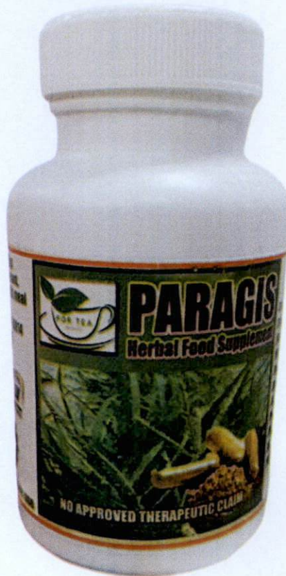
Figure 3. Unregistered FOR TEA Paragis Herbal Food Supplement