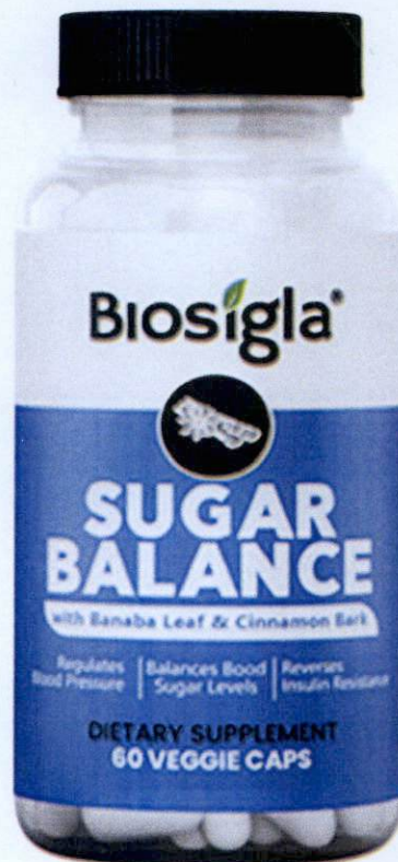
Figure 1. Unregistered BIOSIGLA Sugar Balance with Banaba Leaf & Cinnamon Bark Dietary Supplement

The Food and Drug Administration (FDA) warns all healthcare professionals and the general public NOT TO PURCHASE AND CONSUME the following unregistered food supplements: