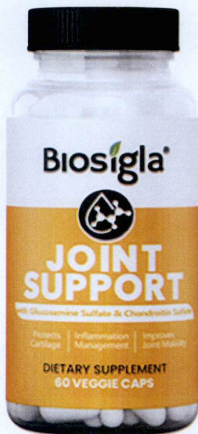
Figure 3. Unregistered BIOSIGLA Joint Support with Glucosamine Sulfate & Chondroitin Sulfate Dietary Supplement