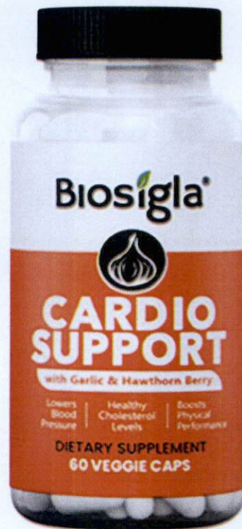
Figure 1. Unregistered BIOSIGLA Cardio Support with Garlic & Hawthorn Berry Dietary Supplement

The Food and Drug Administration (FDA) warns all healthcare professionals and the general public NOT TO PURCHASE AND CONSUME the following unregistered food supplements: