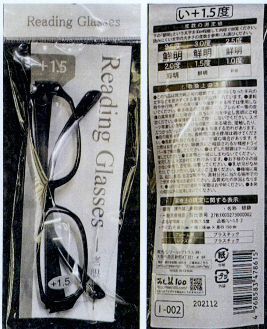
Figure 1. Unnotified Reading Glasses (in Foreign Characters) +1.5

The Food and Drug Administration (FDA) warns all healthcare professionals and the general public NOT TO PURCHASE AND USE the unnotified medical device product: