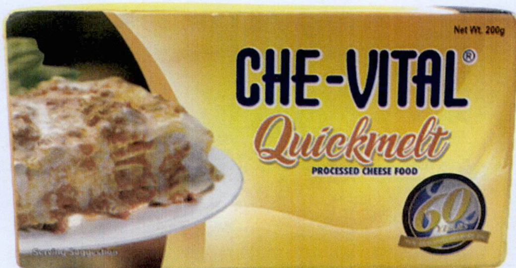
Figure 1. Unregistered CHE-VITAL Quickmelt Processed Cheese Food

The Food and Drug Administration (FDA) warns all healthcare professionals and the general public NOT TO PURCHASE AND CONSUME the following unregistered food products: