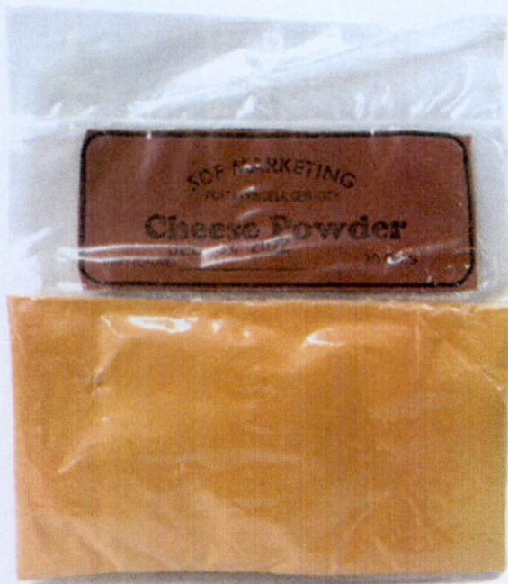
Figure 4. Unregistered SDF MARKETING Cheese Powder