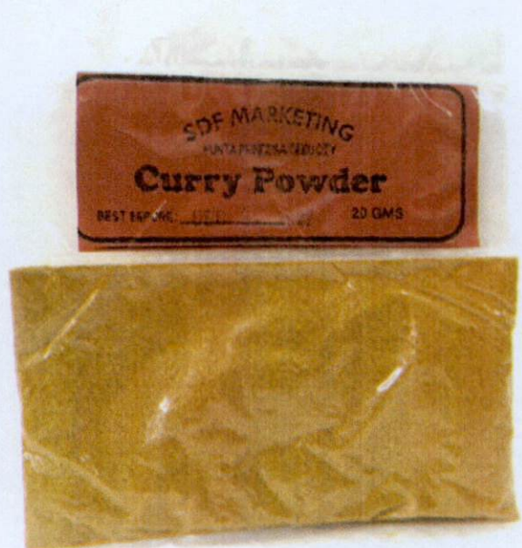
Figure 5. Unregistered SDF MARKETING Curry Powder