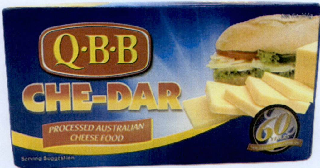
Figure 2. Unregistered QBB CHE-DAR Processed Australian Cheese Food