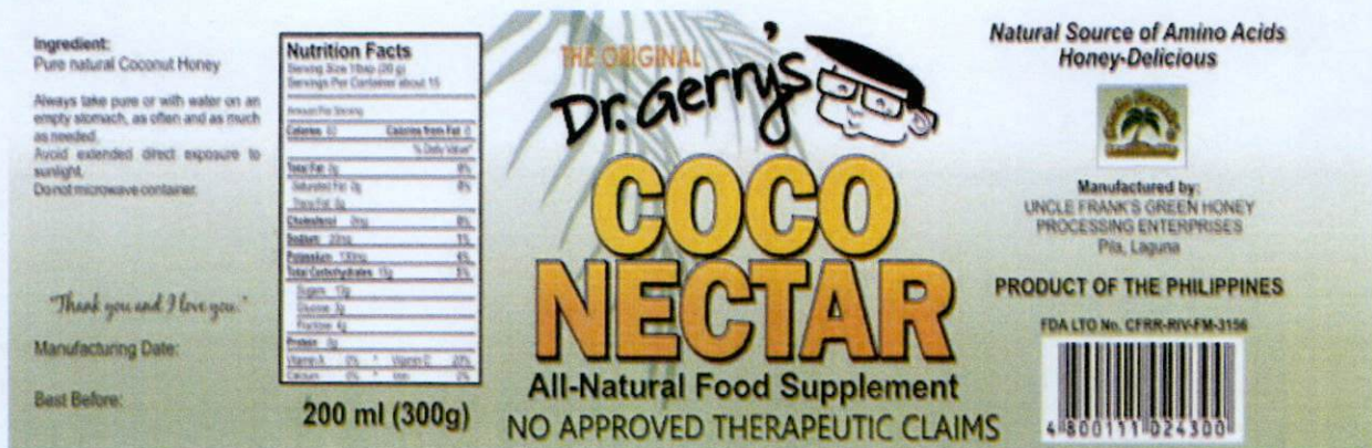
Figure 1. The Approved label of DR. GERRY'S Coco Nectar with registration number FR-4000008011325 issued on 02 August 2022 valid until 02 August 2024 .

The Food and Drug Administration (FDA) informs the public that the food product DR. GERRY'S Coco Nectar is now registered by the Market Authorization Holder (MAH) UNCLE FRANK'S GREEN HONEY PROCESSING ENTERPRISES in accordance to existing FDA rules and regulations.