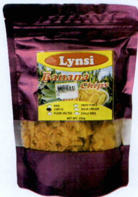
Figure 1. Unregistered LYNSI Banana Chips Cheese

The Food and Drug Administration (FDA) warns all healthcare professionals and the general public NOT TO PURCHASE AND CONSUME the following unregistered food products: