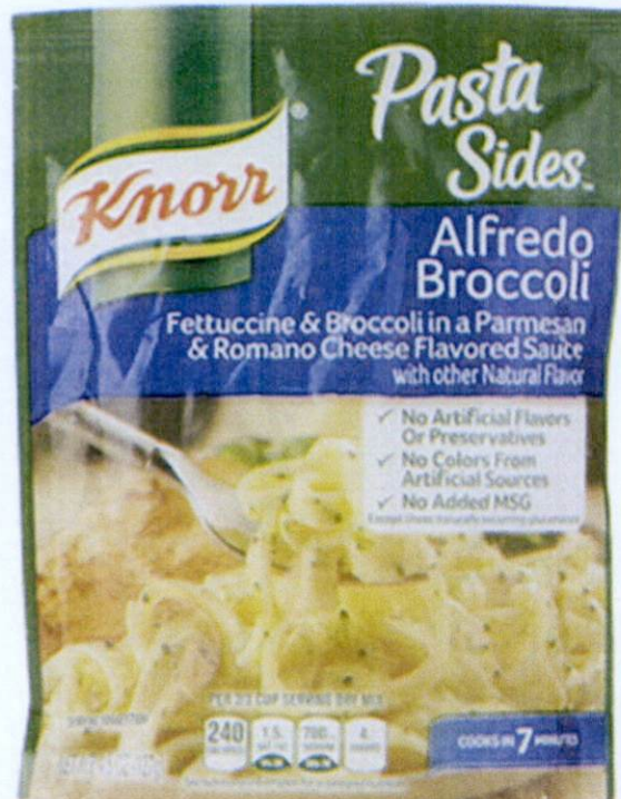
Figure 4. Unregistered KNORR Pasta Sides Alfredo Broccoli