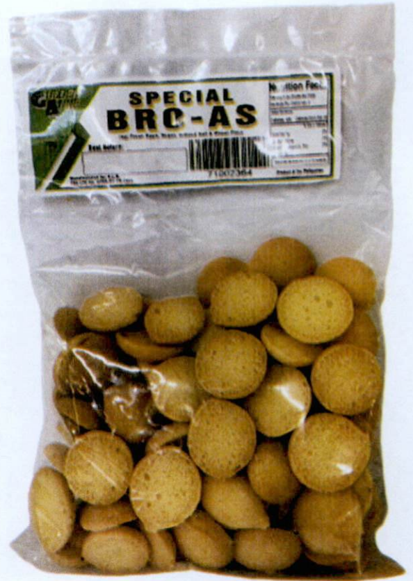
Figure 3. Unregistered GULDEN ANNE Special Bro-as