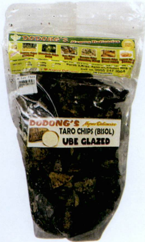
Figure 2. Unregistered DODONG'S NEGROS DELICACIES Taro Chips (Bisol) Ube Glazed