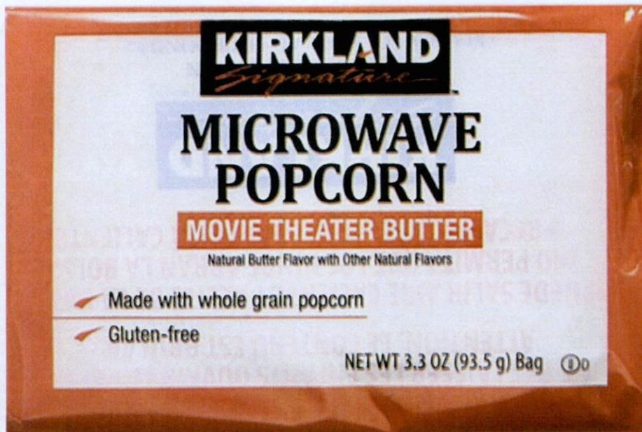
Figure 5. Unregistered KIRKLAND SIGNATURE Microwave Popcorn Movie Theater Butter Natural Butter Flavor with Other Natural Flavors

The FDA verified through online monitoring or post-marketing surveillance that the abovementioned food products are not registered and no corresponding Certificates of Product Registration (CPR) have been issued. Pursuant to the Republic Act No. 9711, otherwise known as the “Food and Drug Administration Act of 2009”, the manufacture, importation, exportation, sale, offering for sale, distribution, transfer, non-consumer use, promotion, advertising or sponsorship of health products without the proper authorization is prohibited.