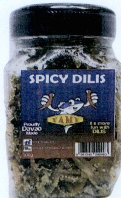
Figure 1. Unregistered YAMY Spicy Dilis

The Food and Drug Administration (FDA) warns all healthcare professionals and the general public NOT TO PURCHASE AND CONSUME the following unregistered food products: