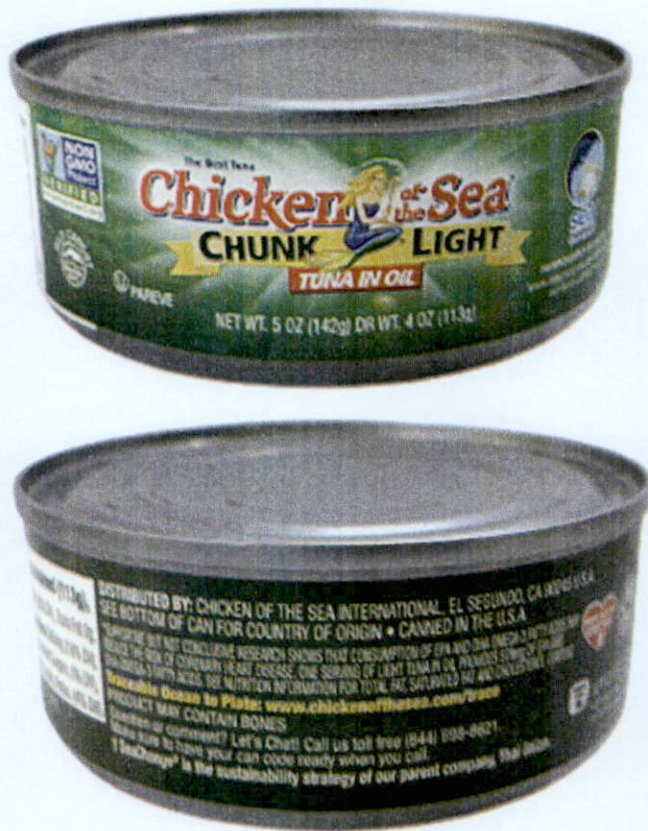
Figure 2. Unregistered CHICKEN OF THE SEA Chunk Light Tuna in Oil