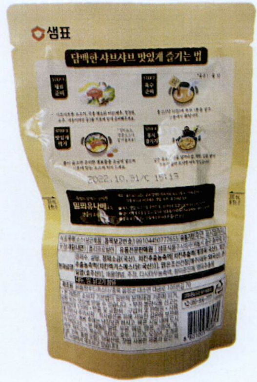
Figure 4. Unregistered Shabu-shabu Soup Base (In Foreign Language)