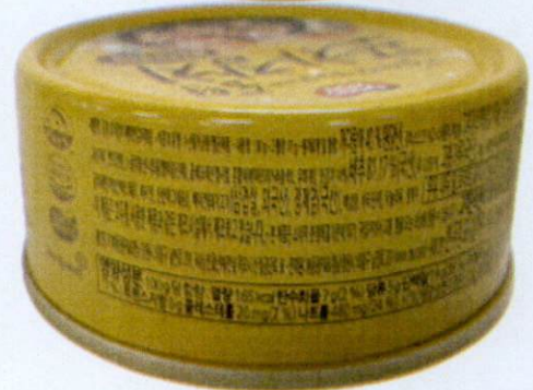
Figure 5. Unregistered DONGWON Canned Food Product with Meat Image in Yellow Can (In Foreign Language)