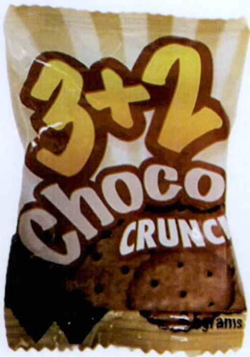
Figure 2. Unregistered 3+2 Choco Crunch