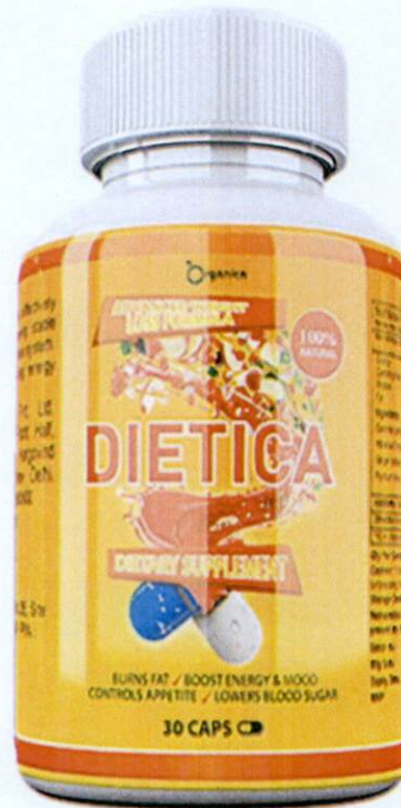
Figure 1. Unregistered ORGANICA Dietica Dietary Supplement

The Food and Drug Administration (FDA) warns all healthcare professionals and the general public NOT TO PURCHASE AND CONSUME the following unregistered food supplements and food products: