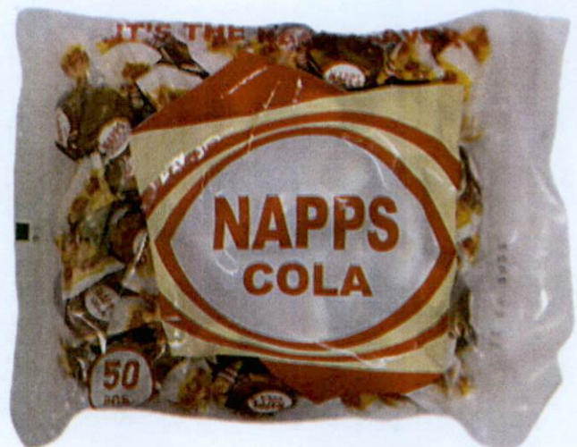
Figure 5. Unregistered NAPPS COLA