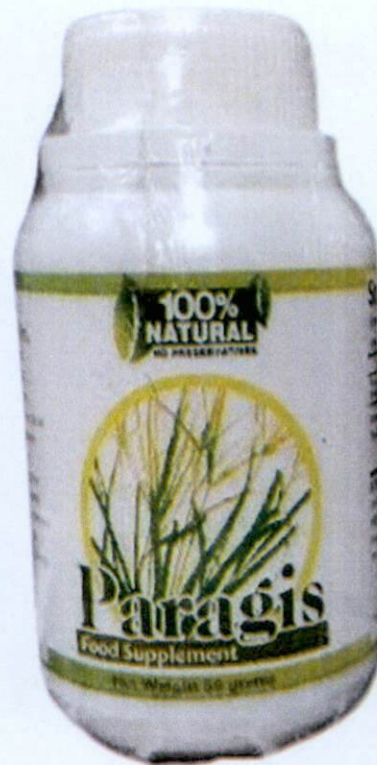
Figure 3. Unregistered NATURAL HERB Paragis Food Supplement