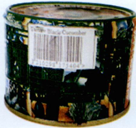
Figure 2. Unregistered TAMA Black Cucumber