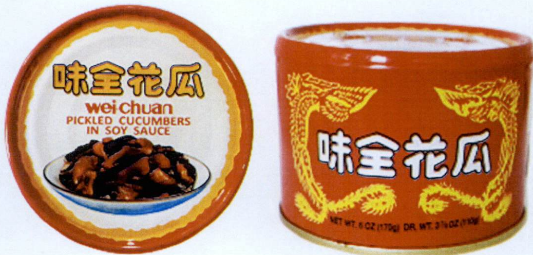
Figure 1. Unregistered WEI-CHUAN Pickled Cucumbers in Soy Sauce

The Food and Drug Administration (FDA) warns all healthcare professionals and the general public NOT TO PURCHASE AND CONSUME the following unregistered food products: