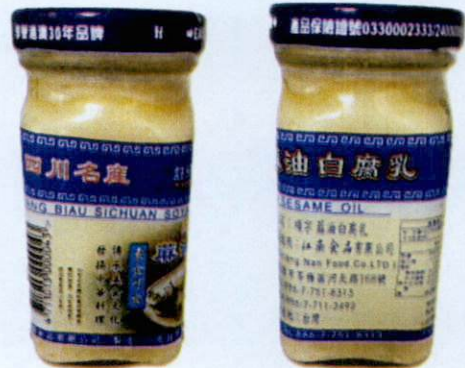
Figure 3. Unregistered SANG BIAU SICHUAN Soya Bean Curd with Chili & Sesame Oil