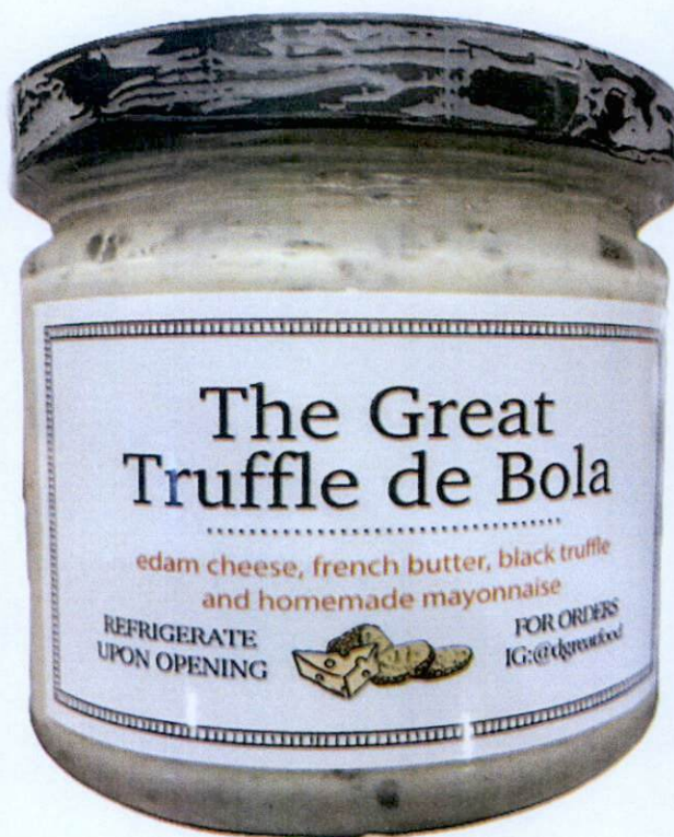
Figure 1. Unregistered THE GREAT Truffle de Bola

The Food and Drug Administration (FDA) warns all healthcare professionals and the general public NOT TO PURCHASE AND CONSUME the following unregistered food products: