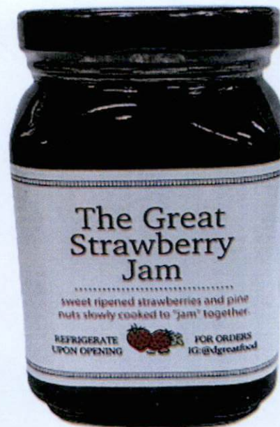
Figure 3. Unregistered THE GREAT Strawberry Jam

The FDA verified through online monitoring or post-marketing surveillance that the abovementioned food products are not registered and no corresponding Certificates of Product Registration (CPR) have been issued. Pursuant to the Republic Act No. 9711, otherwise known as the “Food and Drug Administration Act of 2009”, the manufacture, importation, exportation, sale, offering for sale, distribution, transfer, non-consumer use, promotion, advertising or sponsorship of health products without the proper authorization is prohibited.