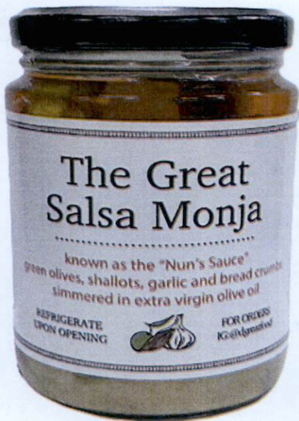
Figure 2. Unregistered THE GREAT Salsa Monja