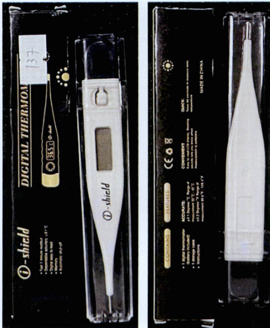
Figure 1. Unregistered i-shield Digital Thermometer

The Food and Drug Administration (FDA) warns all healthcare professionals and the general public NOT TO PURCHASE AND USE the unregistered medical device product: