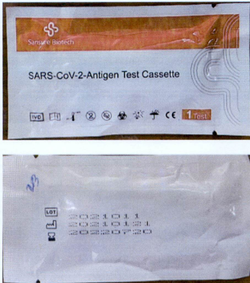
Figure 1. Uncertified Sansure Biotech SARS-CoV-2-Antigen Test Cassette

The Food and Drug Administration (FDA) warns all healthcare professionals and the general public NOT TO PURCHASE AND USE the uncertified COVID-19 test kit: