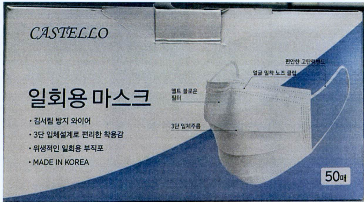
Figure 1. Misbranded Castello Face Mask (In foreign characters)

The Food and Drug Administration (FDA) warns all healthcare professionals and the general public NOT TO PURCHASE AND USE the misbranded medical device product in foreign characters: