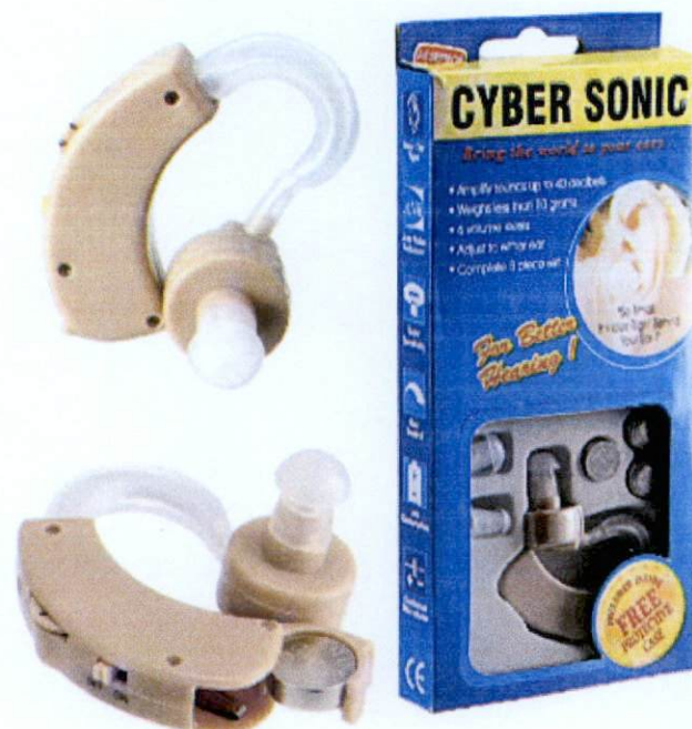
Figure 1. Unnotified Cyber Sonic Famous BTE Personal Sound Amplifier Ear Hearing Aid advertised at Lazada.com.ph

The Food and Drug Administration (FDA) warns all healthcare professionals and the general public NOT TO PURCHASE AND USE the unnotified medical device product: