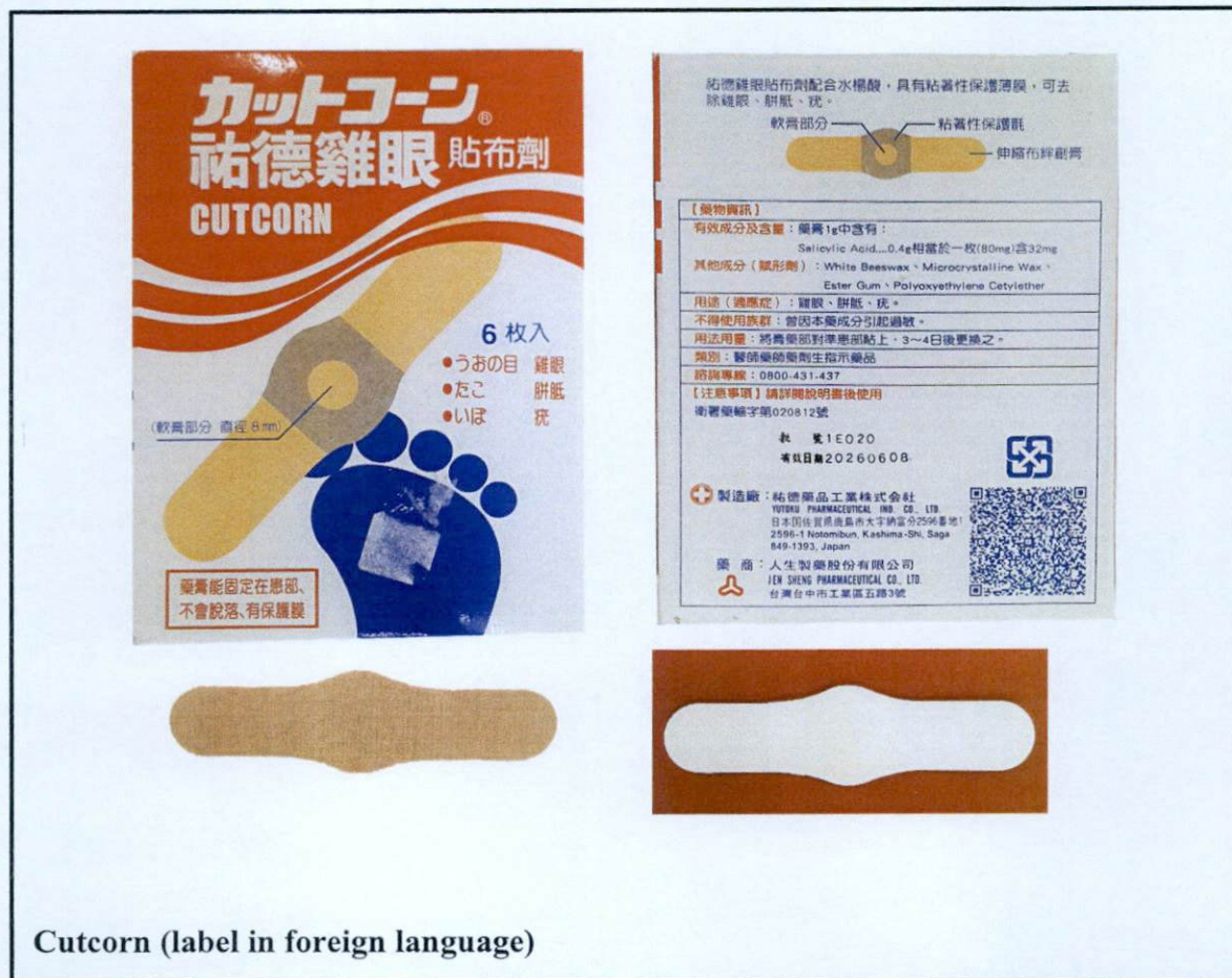
Figure 1: Unregistered drug product

The Food and Drug Administration (FDA) advises the public against the purchase and use of the unregistered drug product: