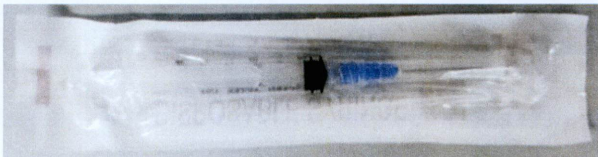
Figure 1. Unregistered Medical Depot Disposable Syringe 3cc/ml 23G x 1" (0.6x25mm)

The FDA verified through post-marketing surveillance that the abovementioned medical device product is not registered and no corresponding Product Registration Certificate has been issued. Pursuant to the Republic Act No. 9711, otherwise known as the "Food and Drug Administration Act of 2009", the manufacture, importation, exportation, sale, offering for sale, distribution, transfer, non-consumer use, promotion, advertising or sponsorship of health products without the proper authorization is prohibited.