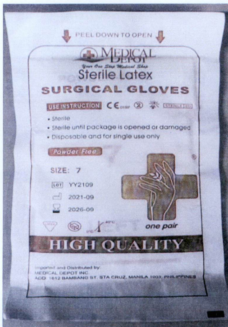
Figure 1. Unnotified Medical Depot Sterile Latex Surgical Gloves

The Food and Drug Administration (FDA) warns all healthcare professionals and the general public NOT TO PURCHASE AND USE the unnotified medical device product: