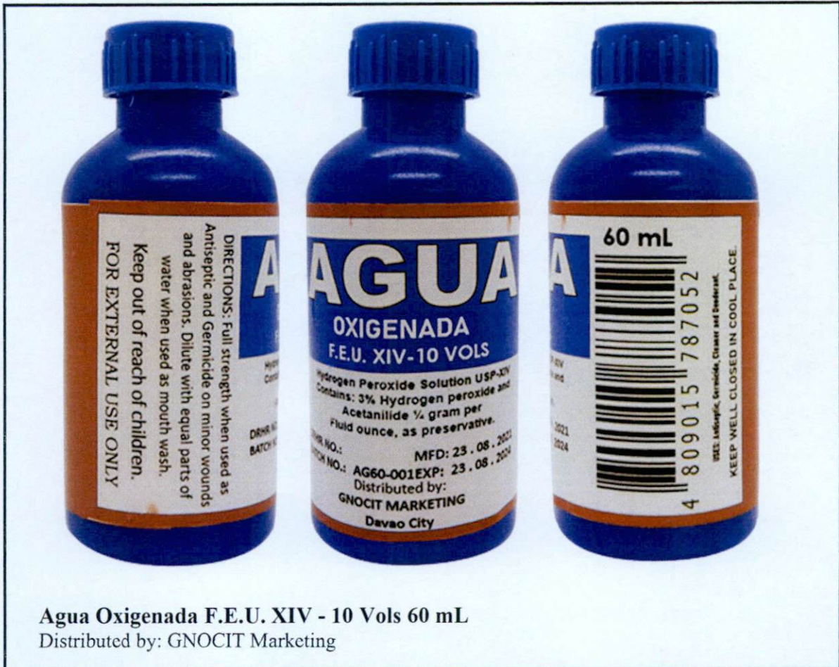
Agua Oxigenada F.E.U. XIV - 10 Vols 60 mL Distributed by: GNOGIT Marketing