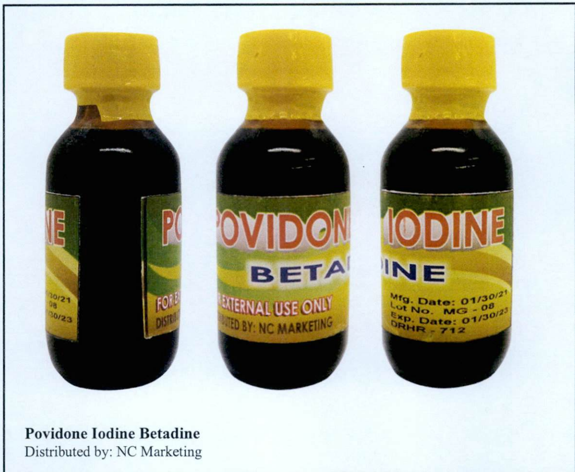
Figure 1. Unregistered drug product

The Food and Drug Administration (FDA) advises the public against the purchase and use of the following unregistered drug products: