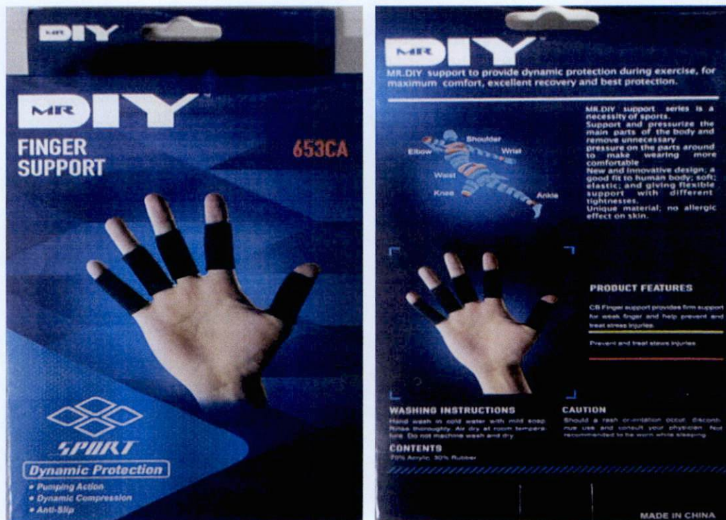
Figure 1. Unnotified Mr. DIY™ Finger Support

The Food and Drug Administration (FDA) warns all healthcare professionals and the general public NOT TO PURCHASE AND USE the following unnotified medical device products: