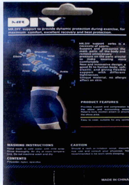
Figure 3. Unnotified Mr. DIY™ Elbow Support