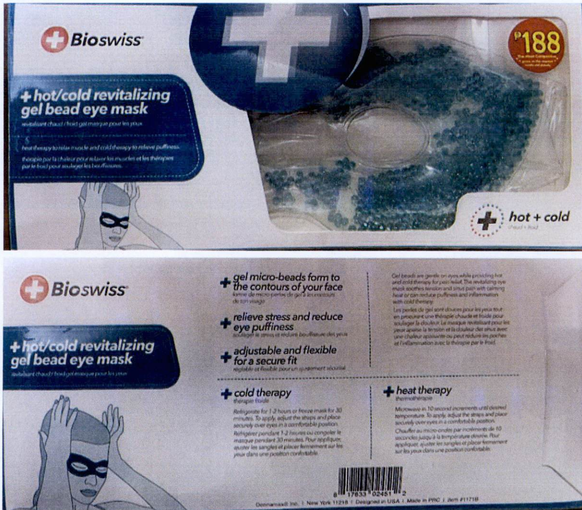
Figure 1. Unregistered Bioswiss® + hot/cold revitalizing gel bead eye mask

The Food and Drug Administration (FDA) warns all healthcare professionals and the general public NOT TO PURCHASE AND USE the unregistered medical device product: