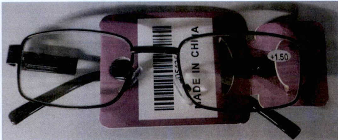
Figure 1. Unnotified Mr. DIY™ Reading Glasses

The Food and Drug Administration (FDA) warns all healthcare professionals and the general public NOT TO PURCHASE AND USE the following unnotified medical device products: