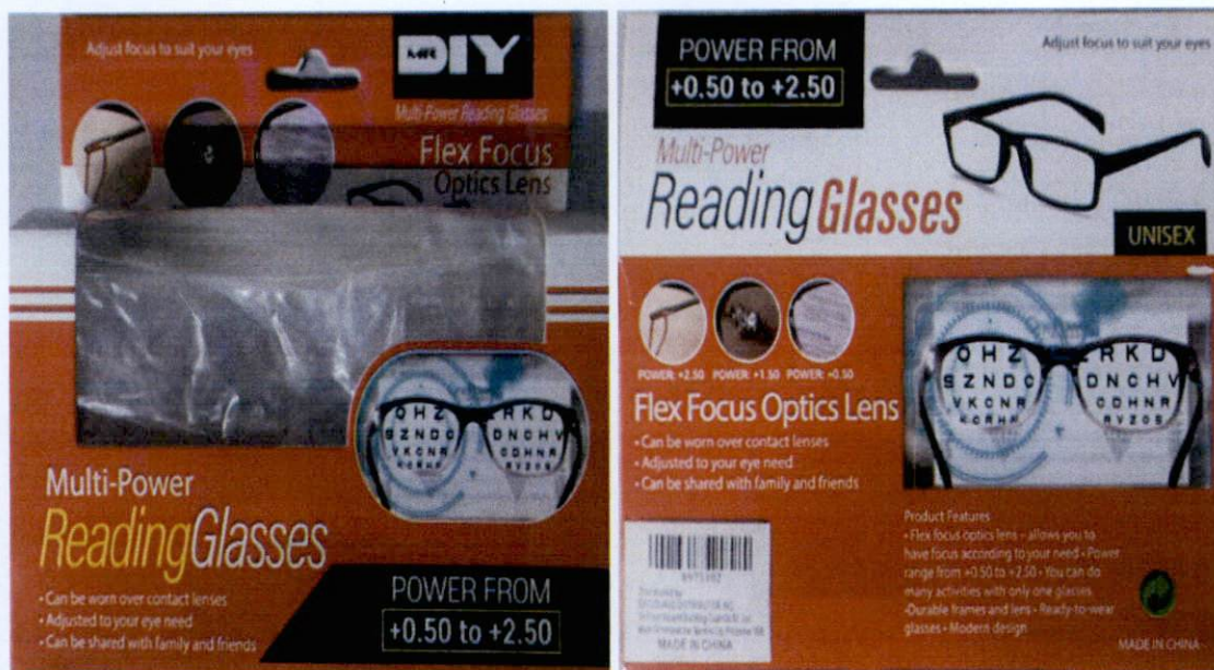
Figure 2. Unnotified Mr. DIY™ Multi-Power Reading Glasses

The FDA verified through post-marketing surveillance that the abovementioned medical device products are not notified and no corresponding Product Notification Certificate have been issued. Pursuant to the Republic Act No. 9711, otherwise known as the “Food and Drug Administration Act of 2009”, the manufacture, importation, exportation, sale, offering for sale, distribution, transfer, non-consumer use, promotion, advertising or sponsorship of health products without the proper authorization is prohibited.