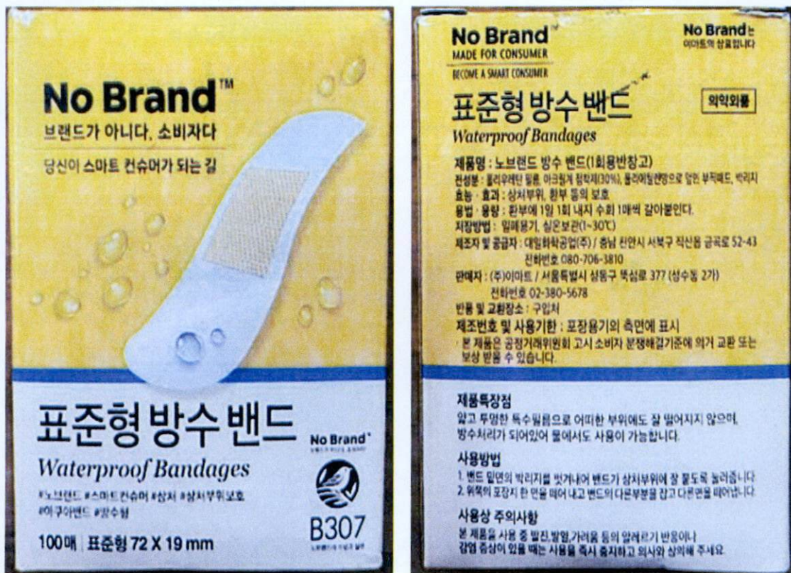
Figure 1. Unnotified No Brand™ Waterproof Bandages

The Food and Drug Administration (FDA) warns all healthcare professionals and the general public NOT TO PURCHASE AND USE the unnotified medical device product: