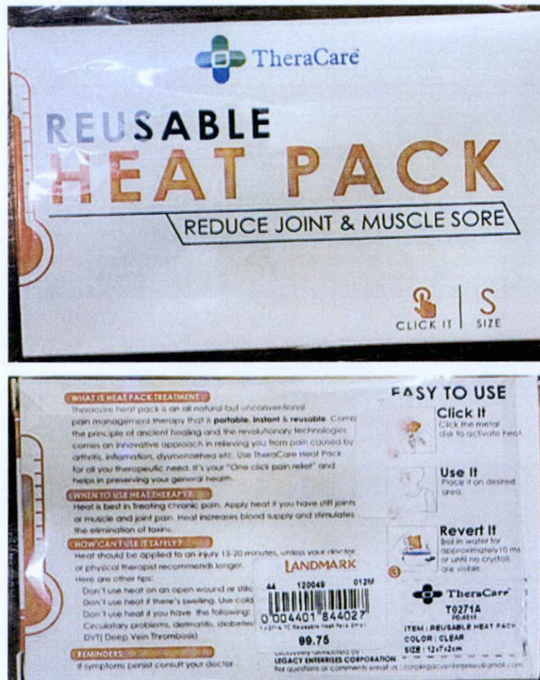
Figure 1. Unnotified TheraCare™ Reusable Heat Pack

The Food and Drug Administration (FDA) warns all healthcare professionals and the general public NOT TO PURCHASE AND USE the unnotified medical device product: