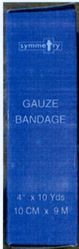
Figure 1. Unnotified Symmetry Gauze Bandage 4" x 10Yds 10 CM x 9 M

The Food and Drug Administration (FDA) warns all healthcare professionals and the general public NOT TO PURCHASE AND USE the unnotified medical device product: