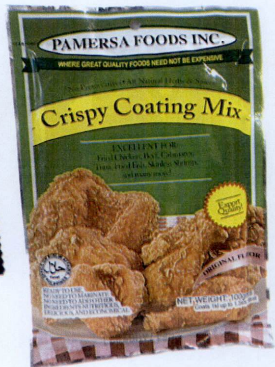
Figure 5. Unregistered PAMERSA FOODS INC. Crispy Coating Mix Original Flavor