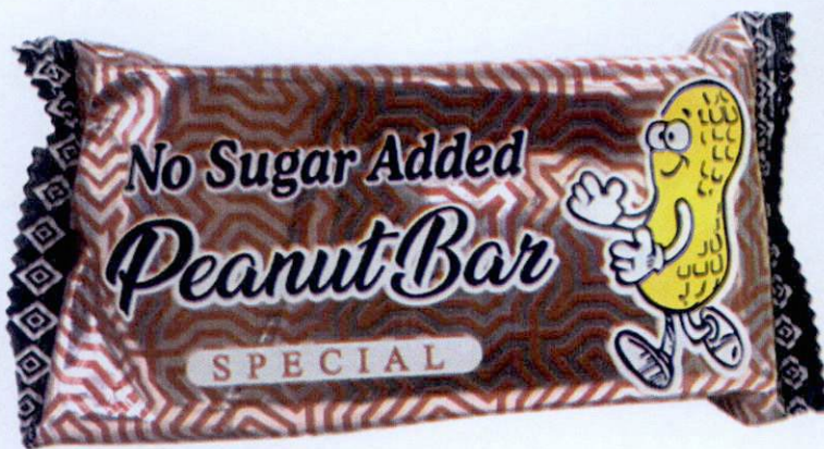
Figure 4. Unregistered (UNBRANDED) Peanut Bar Special