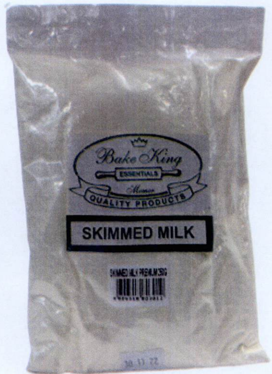
Figure 3. Unregistered BAKE KING ESSENTIALS Skimmed Milk Premium