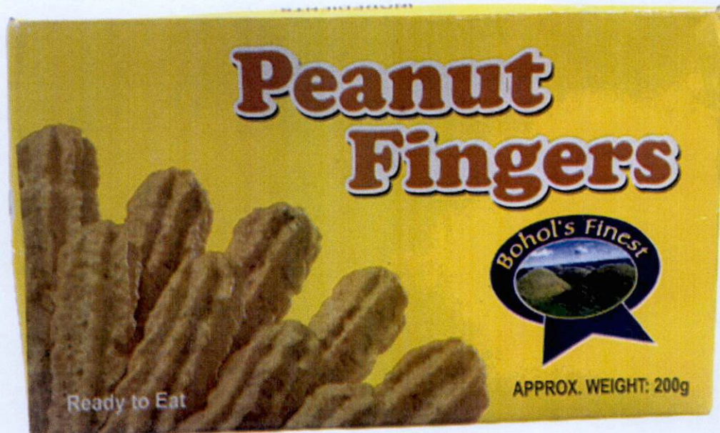
Figure 1. Unregistered BOHOL'S FINEST Peanut Fingers

The Food and Drug Administration (FDA) warns all healthcare professionals and the general public NOT TO PURCHASE AND CONSUME the following unregistered food products: