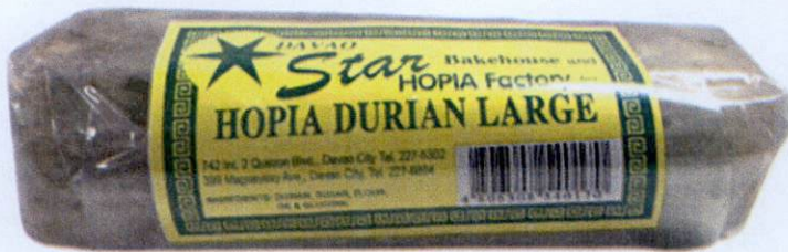
Figure 2. Unregistered DAVAO STAR Hopia Durian Large