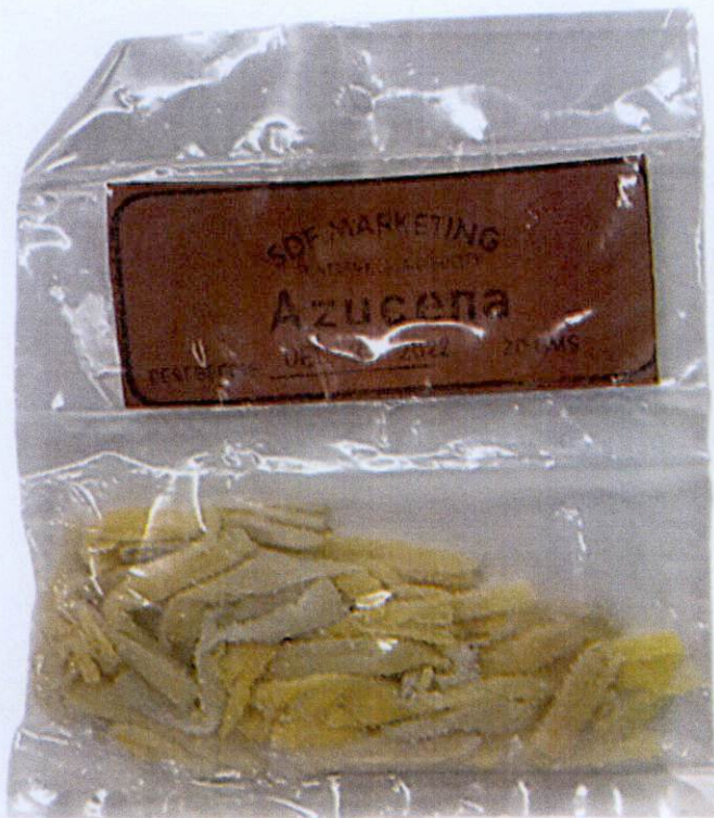
Figure 4. Unregistered SDF MARKETING Azucena