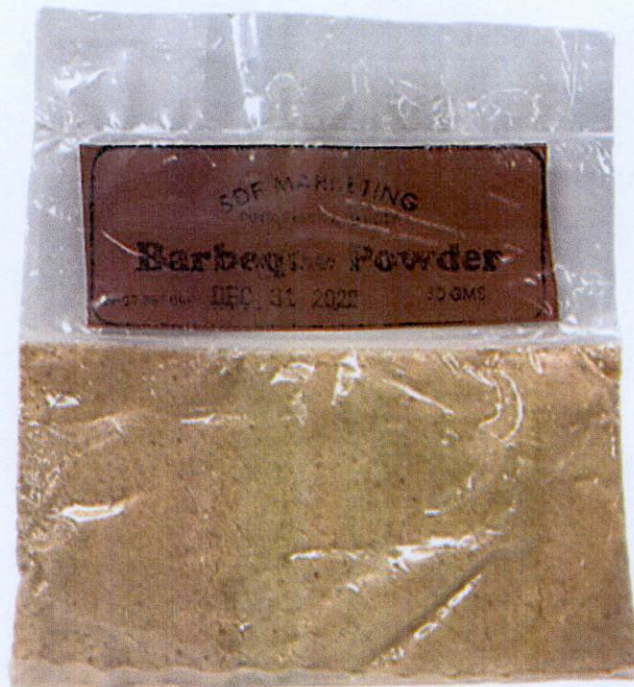
Figure 1. Unregistered SDF MARKETING Barbeque Powder

The Food and Drug Administration (FDA) warns all healthcare professionals and the general public NOT TO PURCHASE AND CONSUME the following unregistered food products: