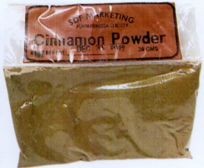
Figure 3. Unregistered SDF MARKETING Cinnamon Powder