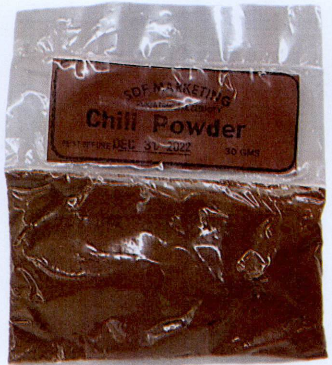
Figure 5. Unregistered SDF MARKETING Chili Powder