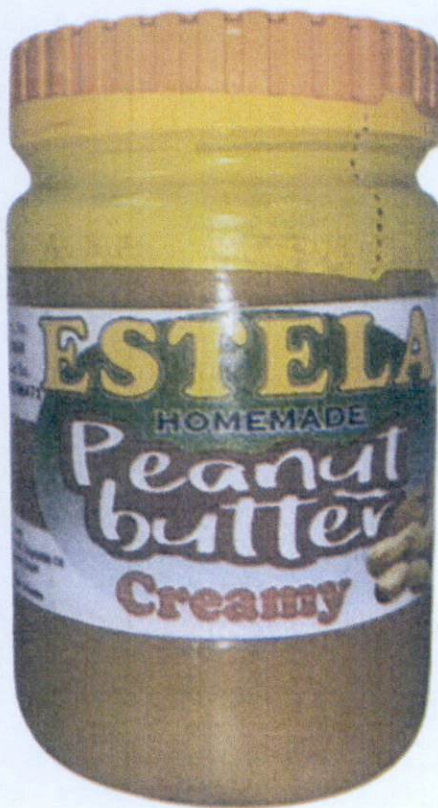
Figure 4. Unregistered ESTELA HOMEMADE Peanut Butter Creamy