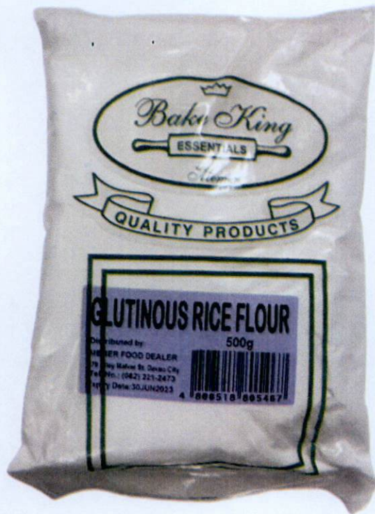
Figure 2. Unregistered BAKE KING ESSENTIALS Glutinous Rice Flour