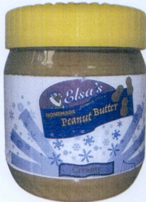
Figure 5. Unregistered ELSA'S HOMEMADE Peanut Butter Creamy