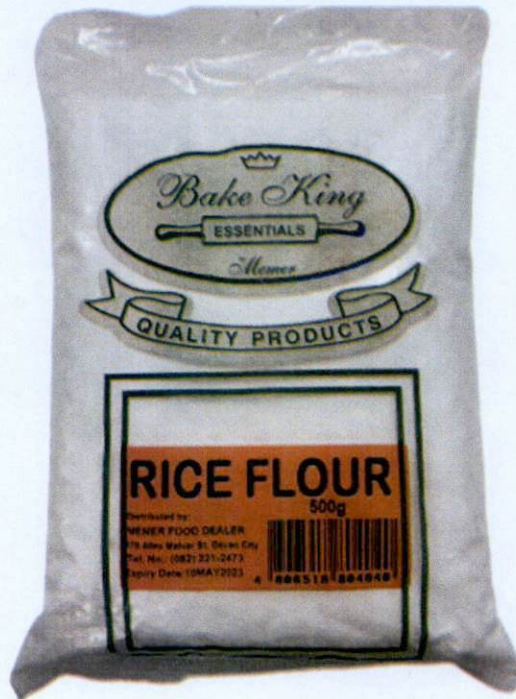
Figure 1. Unregistered BAKE KING ESSENTIALS Rice Flour

The Food and Drug Administration (FDA) warns all healthcare professionals and the general public NOT TO PURCHASE AND CONSUME the following unregistered food products: