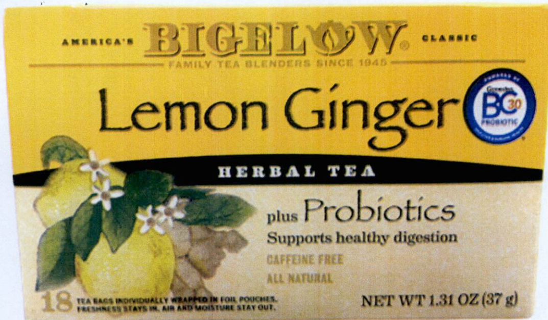
Figure 2. Unregistered BIGELOW Lemon Ginger Herbal Tea Plus Probiotics