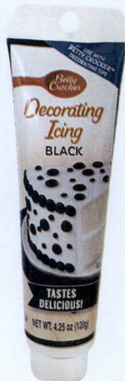
Figure 1. Unregistered BETTY CROCKER Decorating Icing Black

The Food and Drug Administration (FDA) warns all healthcare professionals and the general public NOT TO PURCHASE AND CONSUME the following unregistered food products: