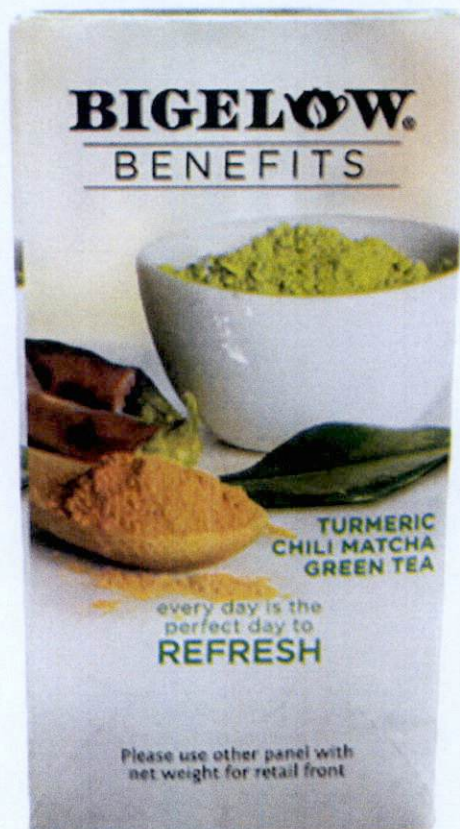
Figure 3. Unregistered BIGELOW BENEFITS Turmeric Chili Matcha Green Tea