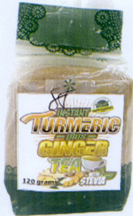
Figure 3. Unregistered SAM-SAMMI Instant Turmeric Plus Ginger Tea with Stevia