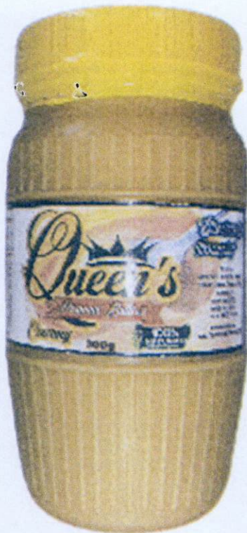
Figure 2. Unregistered QUEEN'S Creamy Peanut Butter