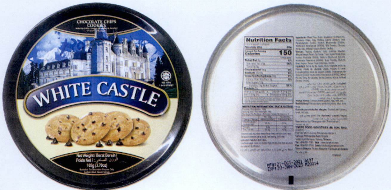
Figure 1. Unregistered WHITE CASTLE Chocolate Chips Cookies

The Food and Drug Administration (FDA) warns all healthcare professionals and the general public NOT TO PURCHASE AND CONSUME the following unregistered food products: