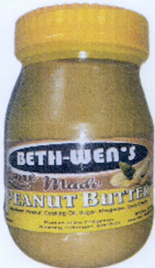
Figure 5. Unregistered BETH-WEN'S Homemade Peanut Butter