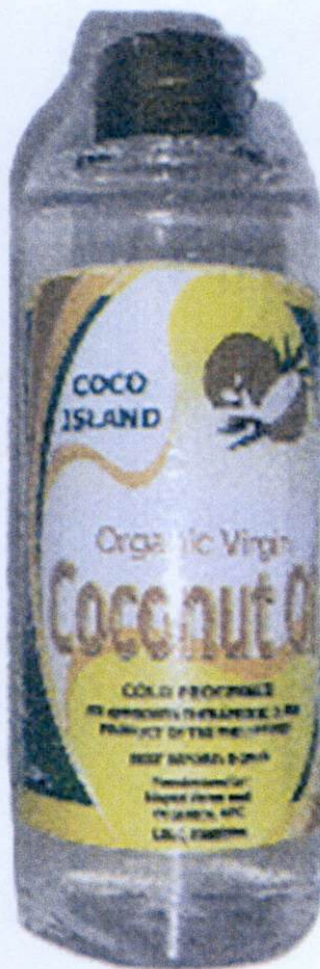
Figure 4. Unregistered COCO ISLAND Organic Virgin Coconut Oil Cold Processed