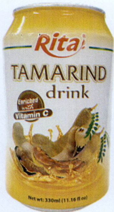
Figure 2. Unregistered RITA Tamarind Drink