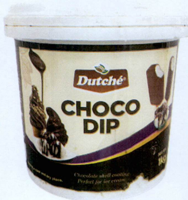
Figure 1. Unregistered DUTCHE Choco Dip

The Food and Drug Administration (FDA) warns all healthcare professionals and the general public NOT TO PURCHASE AND CONSUME the following unregistered food products and food supplement: