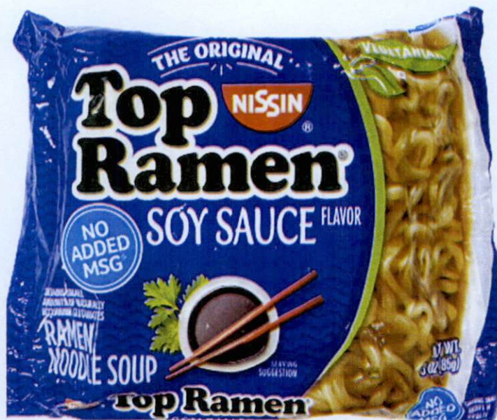
Figure 3. Unregistered NISSIN Top Ramen Ramen Noodle Soup Soy Sauce Flavor