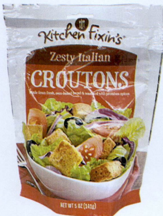
Figure 4. Unregistered KITCHEN FIXIN'S Zesty Italian Croutons