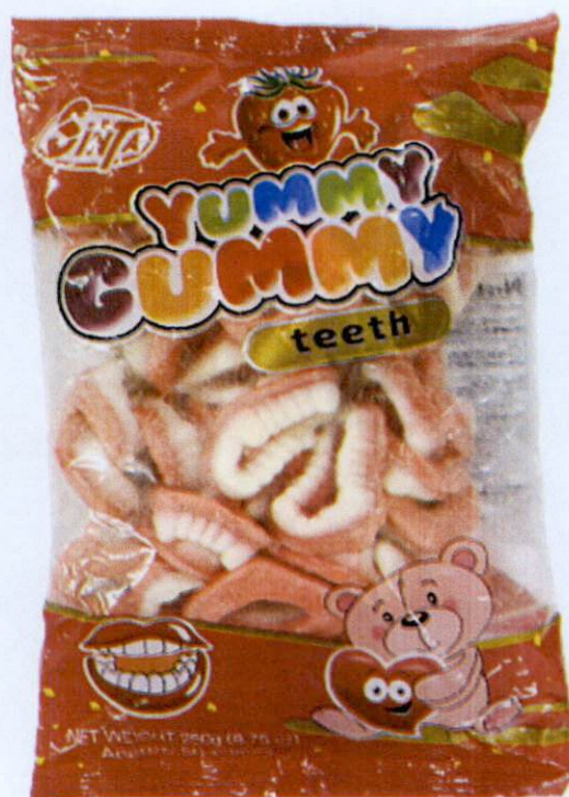
Figure 5. Unregistered SINTA Yummy Gummy Teeth

The FDA verified through online monitoring or post-marketing surveillance that the abovementioned food products are not registered and no corresponding Certificates of Product Registration (CPR) have been issued. Pursuant to the Republic Act No. 9711, otherwise known