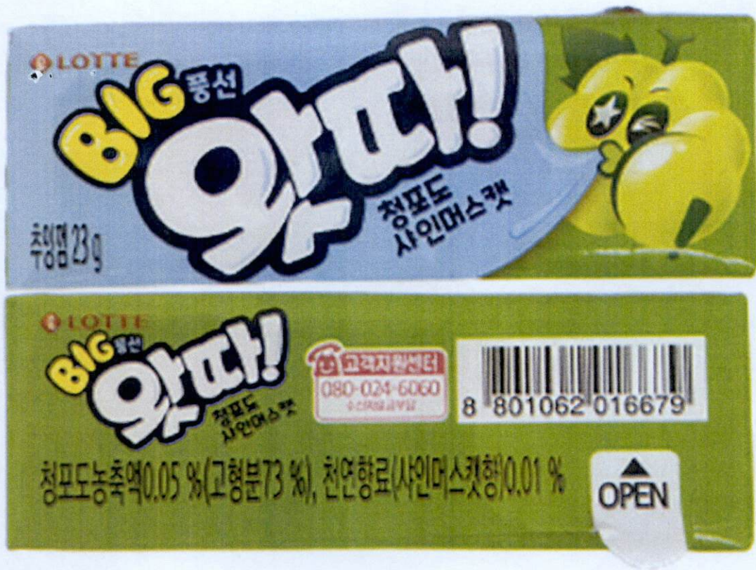
Figure 2. Unregistered LOTTE Big (In Foreign Language)