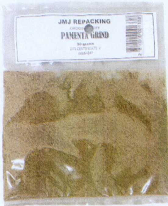
Figure 1. Unregistered JMJ REPACKING Pamenta Grind

The Food and Drug Administration (FDA) warns all healthcare professionals and the general public NOT TO PURCHASE AND CONSUME the following unregistered food products and food supplement: