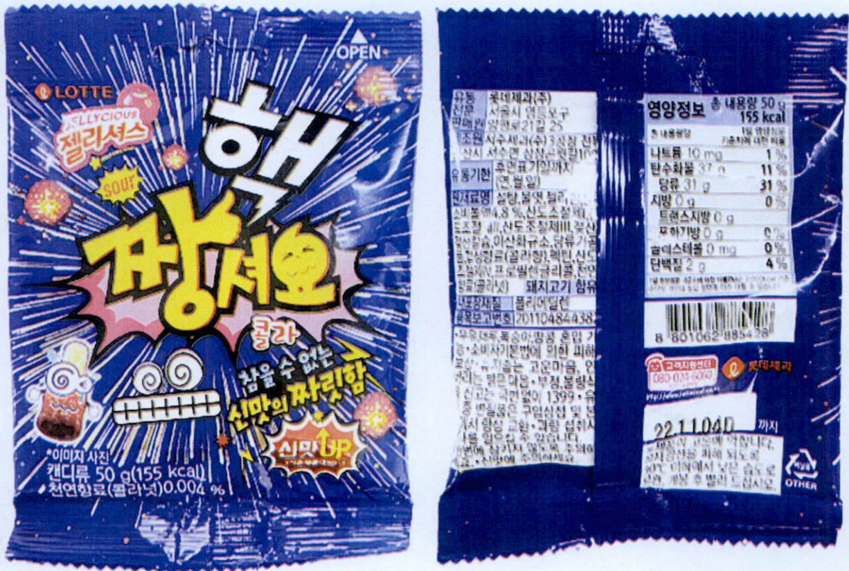
Figure 4. Unregistered LOTTE Product in blue packaging (In Foreign Language)