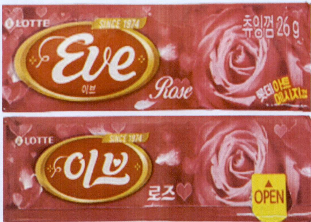
Figure 3. Unregistered LOTTE Eve Rose (In Foreign Language)