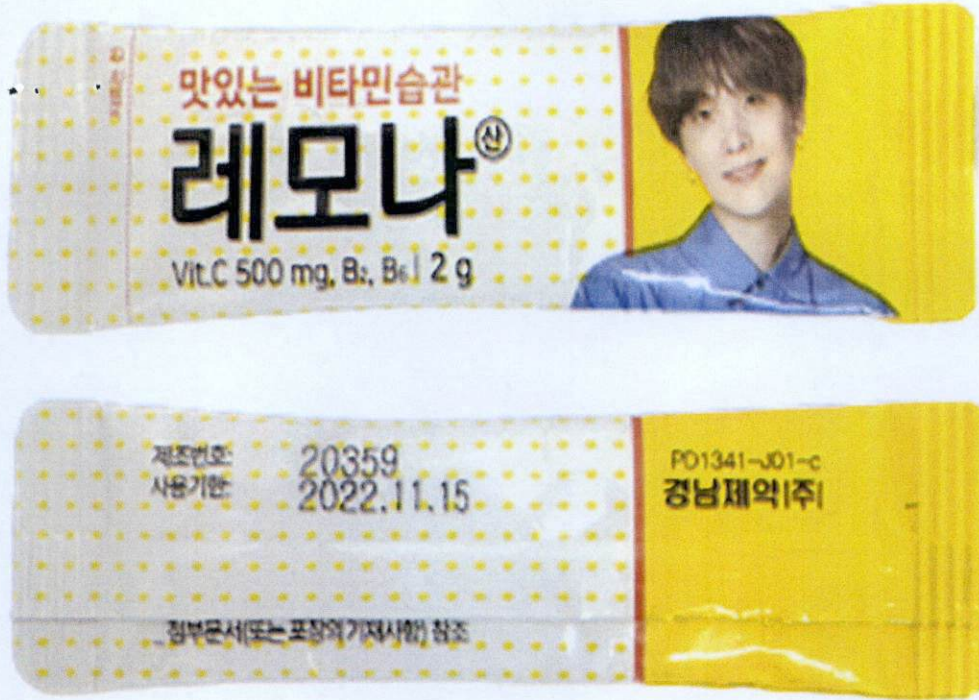
Figure 4. Unregistered Food Product with Male Character in Yellow Packaging (In Foreign Language)