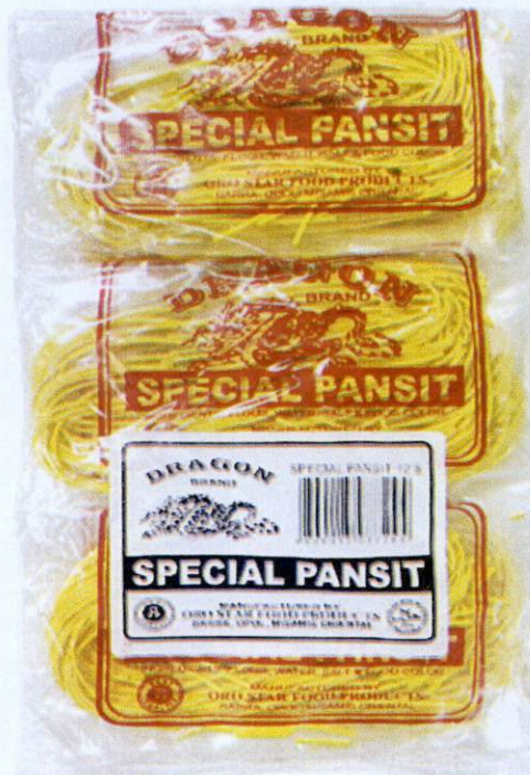
Figure 1. Unregistered DRAGON BRAND Special Pansit

The Food and Drug Administration (FDA) warns all healthcare professionals and the general public NOT TO PURCHASE AND CONSUME the following unregistered food products and food supplement: