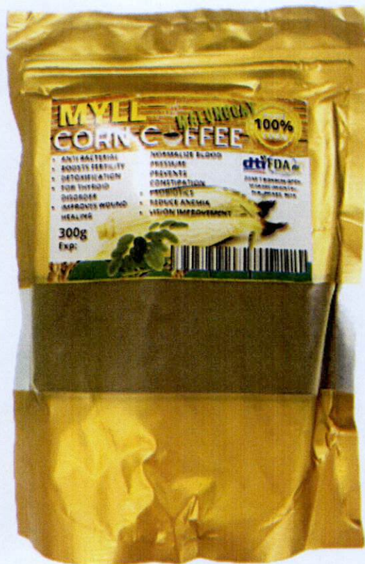
Figure 3. Unregistered MYLL Corn Coffee with Malunggay