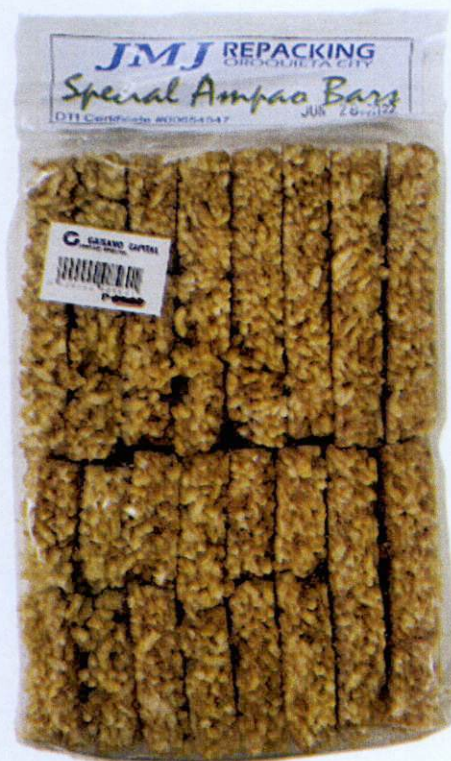
Figure 4. Unregistered JMJ REPACKING Special Ampao Bars