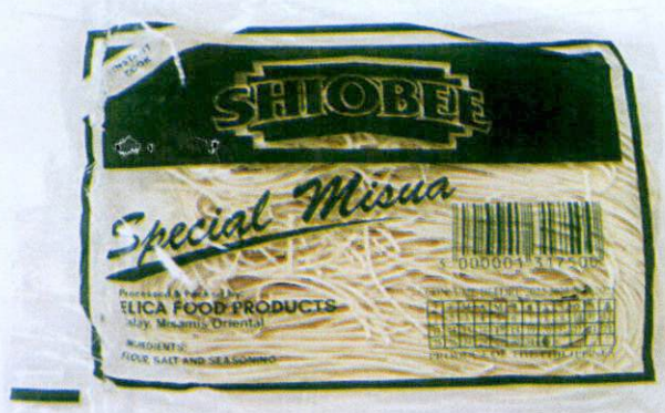
Figure 2. Unregistered SHIOBEE Special Misua