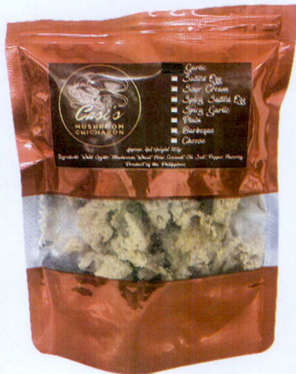
Figure 4. Unregistered CASI'S Mushroom Chicharon Garlic