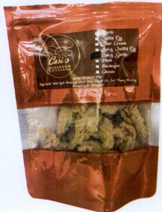
Figure 1. Unregistered CASI'S Mushroom Chicharon Spicy Garlic

The Food and Drug Administration (FDA) warns all healthcare professionals and the general public NOT TO PURCHASE AND CONSUME the following unregistered food products: