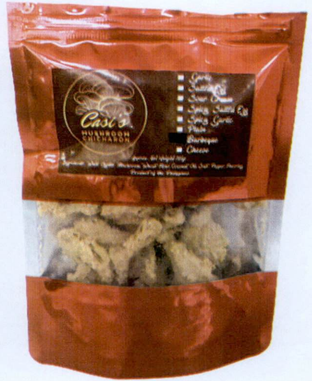
Figure 3. Unregistered CASI'S Mushroom Chicharon Barbeque