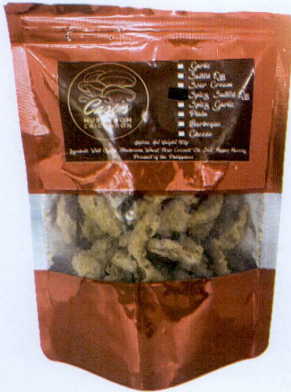
Figure 2. Unregistered CASI'S Mushroom Chicharon Spicy Salted Egg