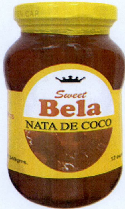
Figure 2. Unregistered SWEET BELA Nata De Coco