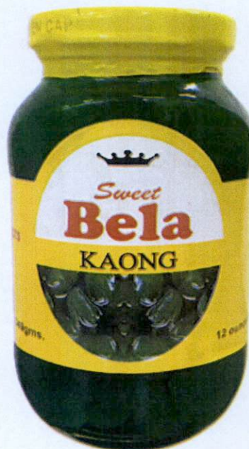
Figure 1. Unregistered SWEET BELA Kaong

The Food and Drug Administration (FDA) warns all healthcare professionals and the general public NOT TO PURCHASE AND CONSUME the following unregistered food products and food supplement: