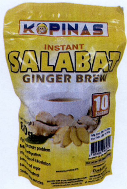
Figure 5. Unregistered KOPINAS Instant Salabat Ginger Brew

The FDA verified through online monitoring or post-marketing surveillance that the abovementioned food products are not registered and no corresponding Certificates of Product Registration (CPR) have been issued. Pursuant to the Republic Act No. 9711, otherwise known as the “Food and Drug Administration Act of 2009”, the manufacture, importation, exportation, sale, offering for sale, distribution, transfer, non-consumer use, promotion, advertising or sponsorship of health products without the proper authorization is prohibited.