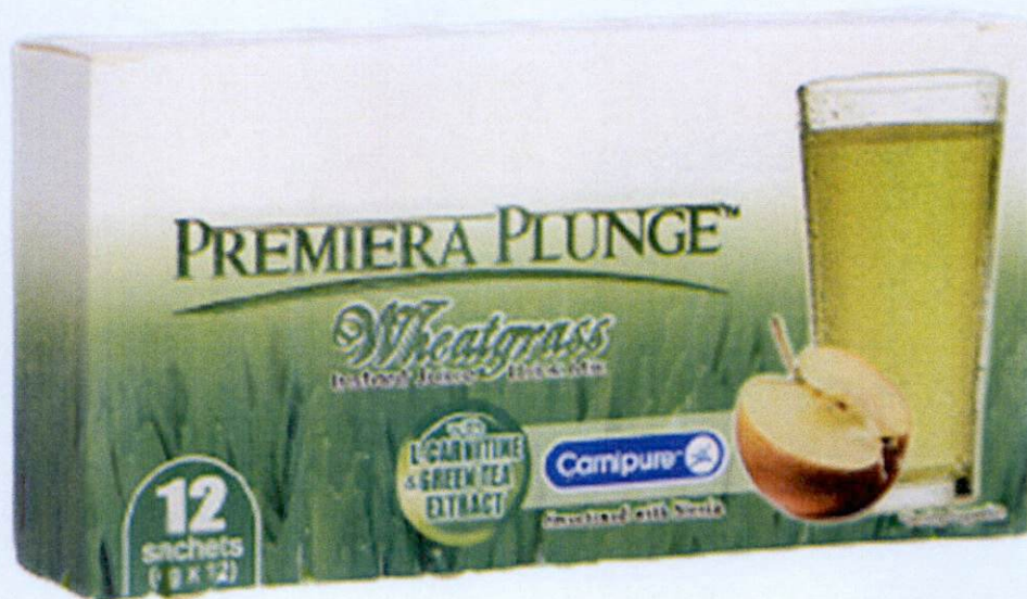
Figure 3. Unregistered LIFE SYNERGY PREMIERA PLUNGE Wheatgrass Instant Juice Drink Mix