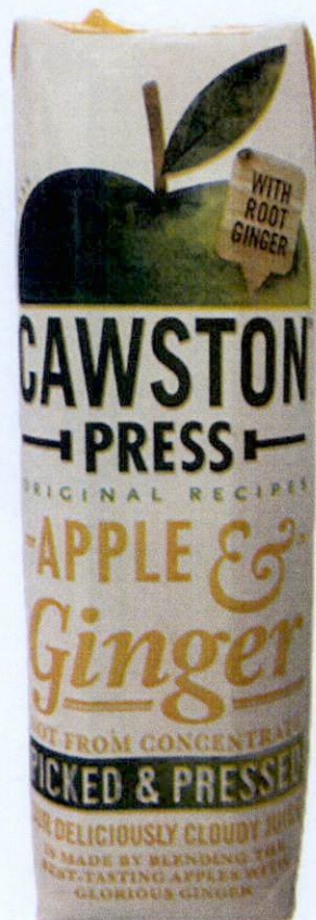
Figure 3. Unregistered CAWSTON PRESS Apple & Ginger