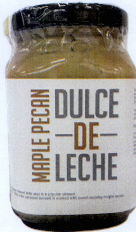
Figure 1. Unregistered DULCE DE LECHE Maple Pecan

The Food and Drug Administration (FDA) warns all healthcare professionals and the general public NOT TO PURCHASE AND CONSUME the following unregistered food products: