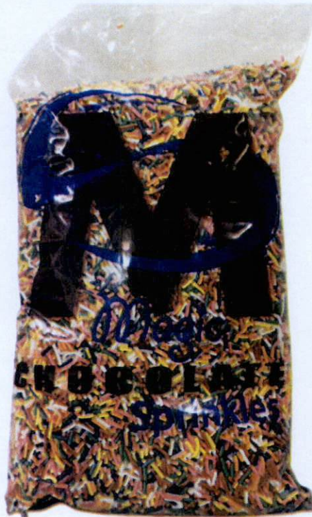
Figure 1. Unregistered M Magic Chocolate Sprinkles

The Food and Drug Administration (FDA) warns all healthcare professionals and the general public NOT TO PURCHASE AND CONSUME the following unregistered food products: