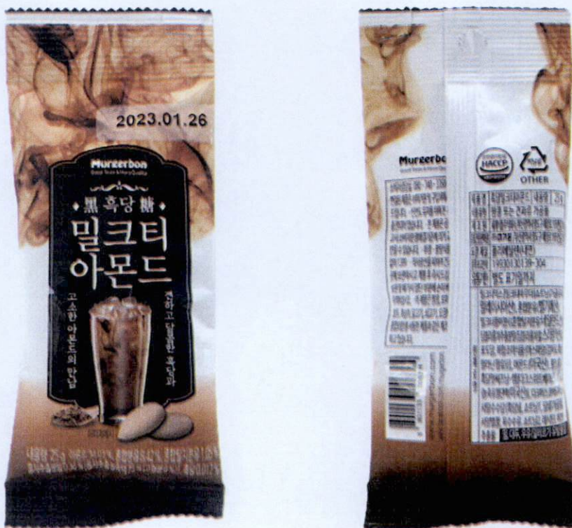
Figure 3. Unregistered MURGERBON Food Product with Milk Tea and Almond Image in Brown Packaging (In Foreign Language)