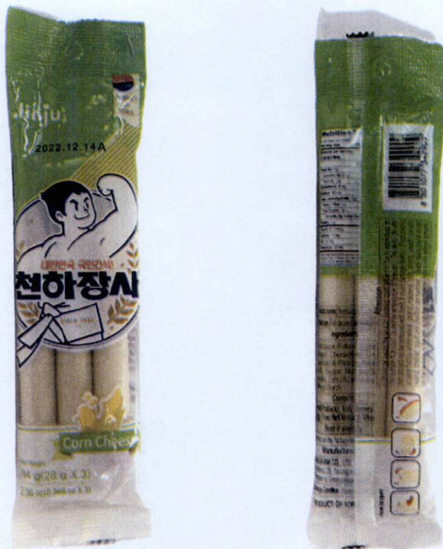
Figure 2. Unregistered JINJU Corn Cheese